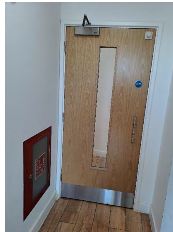
Communal area fire door at Flats 1- 21, 2 Vicars Road.