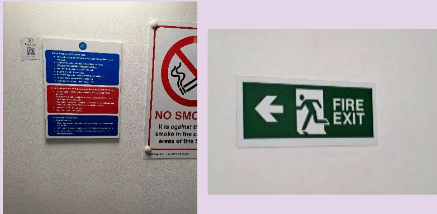
Fire Action Notice and Fire Exit Sign at Flats 1- 21, 2 Vicars Road.

We have installed Fire Action Notices and Fire Exit Signs in your building.