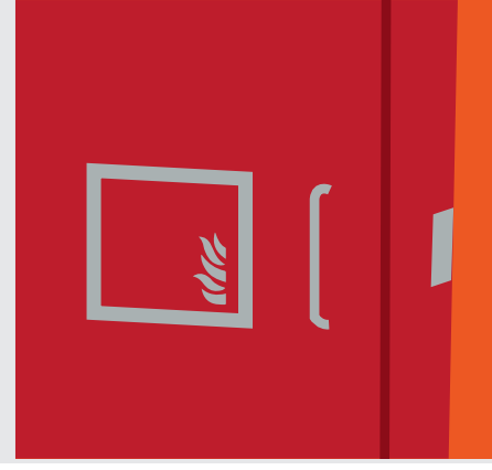
Secure Information Box at Great Russell Mansions.

If you need help in the event of an emergency such as a fire, due to a physical disability or long term medical condition or another disorder, please let us know.