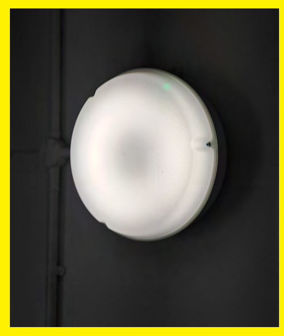
Emergency lighting at Great Russell Mansions.

An emergency lighting system is generally comprised of selfcontained 3hr battery back-up-maintained LED luminaires.