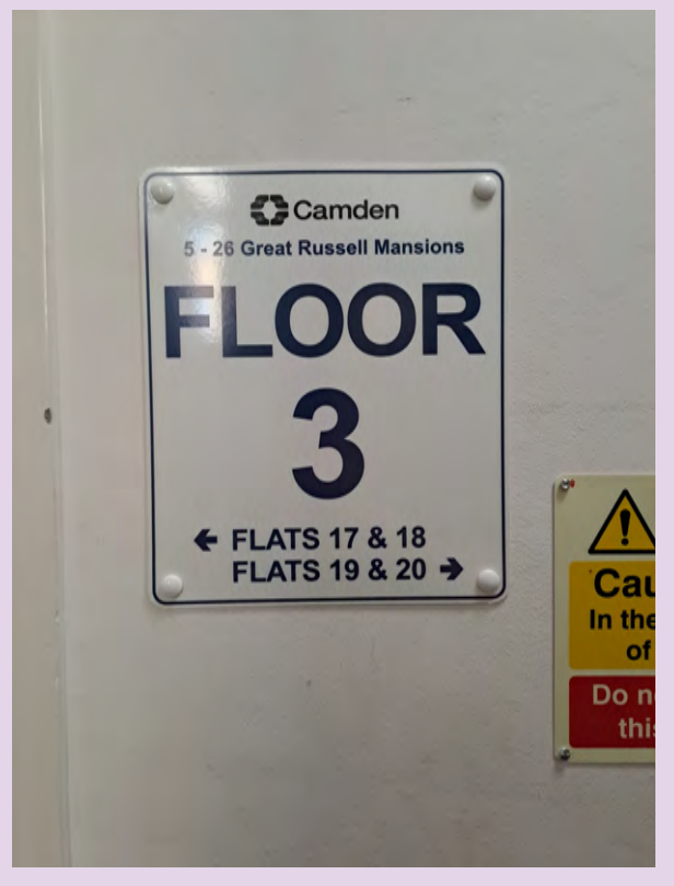
Third floor wayfinding signage at Great Russell Mansions

Wayfinding signage is a visual communication tool to assist the Fire and Rescue Service in locating specific flats as they navigate their way round a building.