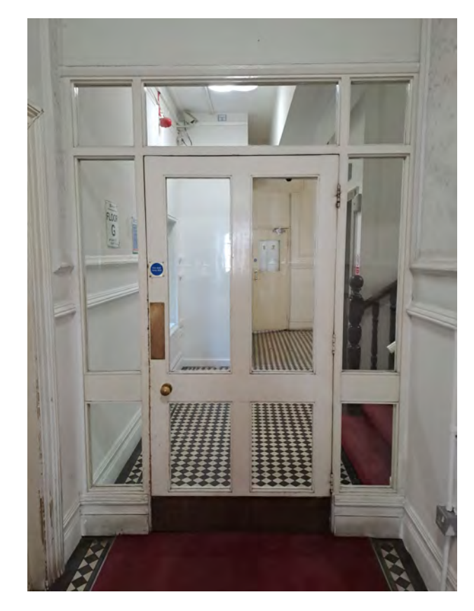
Communal Fire Door at Great Russell Mansions