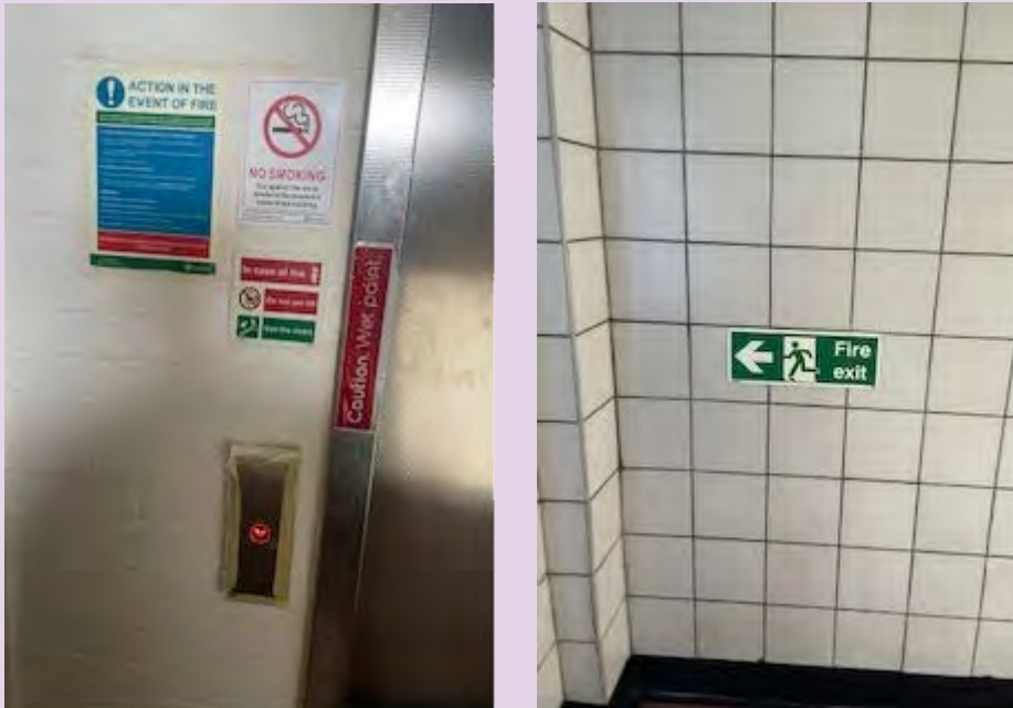
Fire Action Notices and Fire Exit Signs at 23-34 Primrose Hill Court.

We have installed Fire Action Notices and Fire Exit Signs in your building.