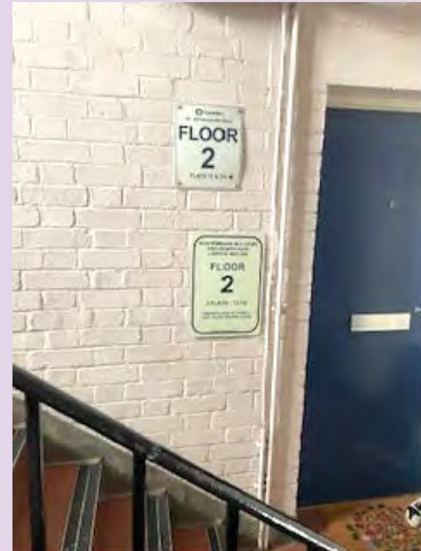
Wayfinding Signage at 23-34 Primrose Hill Court.

Wayfinding signage is a visual communication tool to assist the Fire and Rescue Service in locating specific flats as they navigate their way round a building.