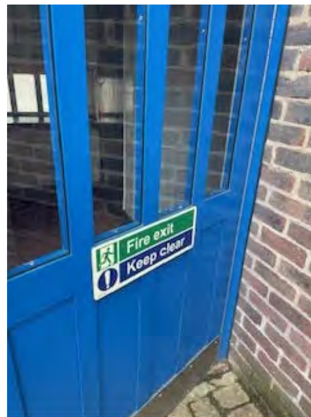
Fire door with fire exit sign at 23-34 Primrose Hill Court.