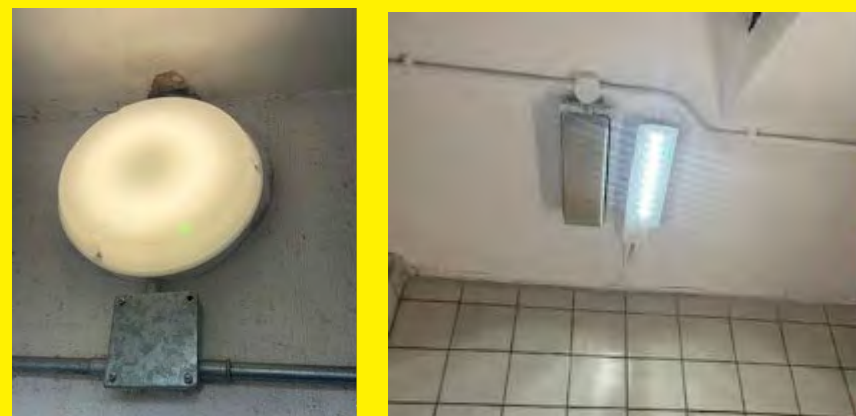
Emergency lights at 23-34 Primrose Hill Court.

Emergency lighting provides illumination in instances where mains power may have failed. It illuminates escape routes, emergency exit/s and firefighting equipment. It will provide illumination to signage and provide sufficient lighting to help you to escape.