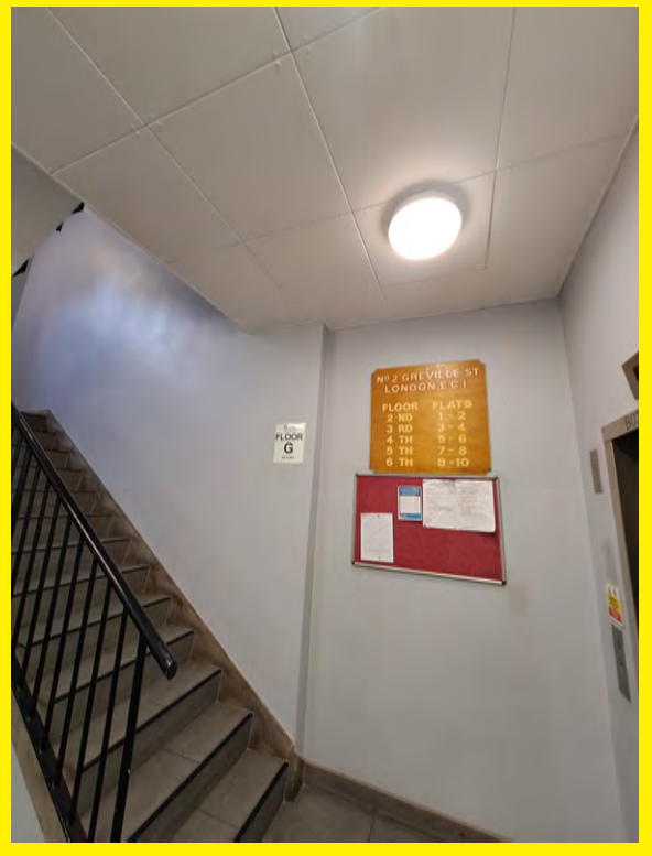
Emergency lighting in stairwell at 2 Greville Street.

Emergency lighting provides illumination in instances where mains power may have failed. It illuminates escape routes, emergency exit/s and firefighting equipment. It will provide illumination to signage and provide sufficient lighting to help you to escape.