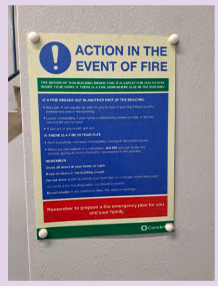
Fire Action Notice at 2 Greville Street.

We have installed Fire Action Notices and Fire Exit Signs in your building.