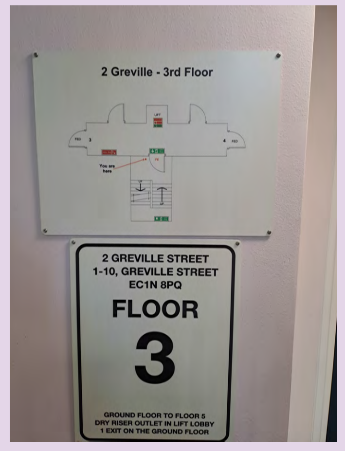
Wayfinding signage at 2 Greville Street.

Wayfinding signage is a visual communication tool to assist the Fire and Rescue Service in locating specific flats as they navigate their way round a building.