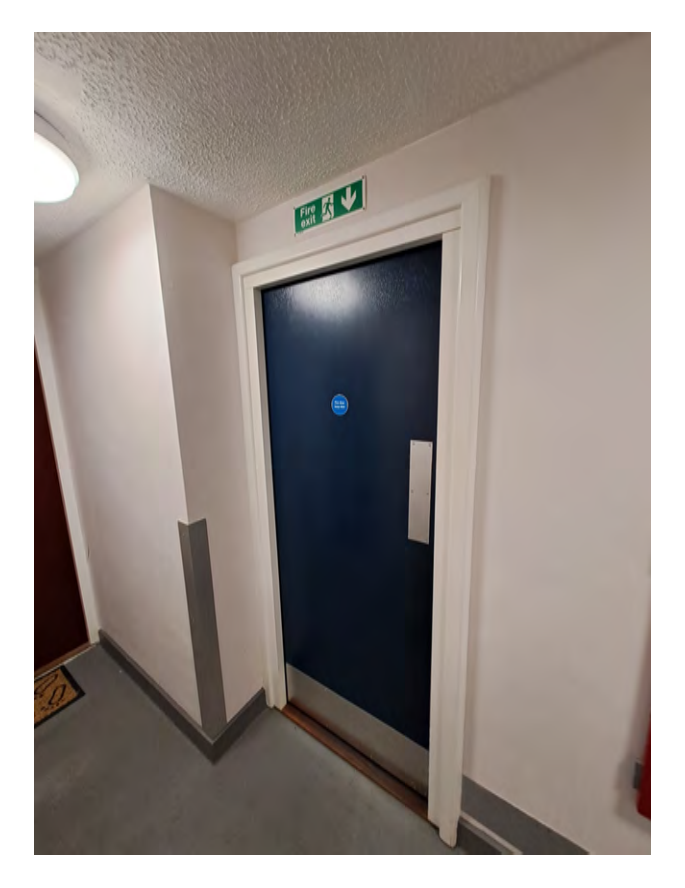
Fire door leading to stairwell at 2 Greville Street.