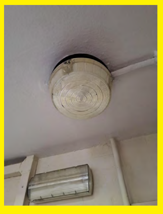
Emergency lighting at 2-42 Laney House.

Emergency lighting provides illumination in instances where mains power may have failed. It illuminates escape routes, emergency exit/s and firefighting equipment. It will provide illumination to signage and provide sufficient lighting to help you to escape.