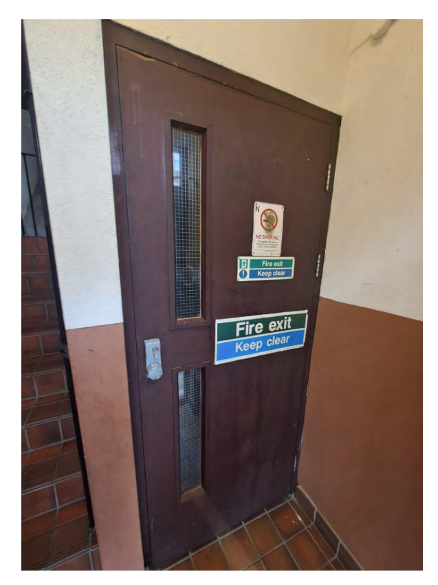
Communal Fire Door at 2-42 Laney House.