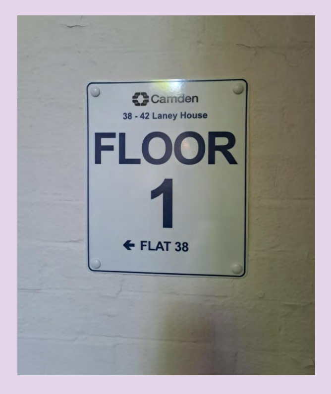
Wayfinding signage at 2-42 Laney House.

Wayfinding signage is a visual communication tool to assist the Fire and Rescue Service in locating specific flats as they navigate their way round a building.