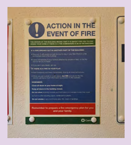
Fire Action Notice at 2-42 Laney House.

We have installed fire action notices in your building.