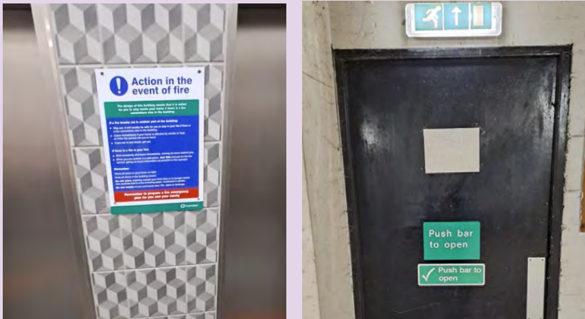
Fire Action Notice and Fire Exit Sign at 11-84 Medway Court.

We have installed Fire Action Notices and Fire Exit Signs in your building.