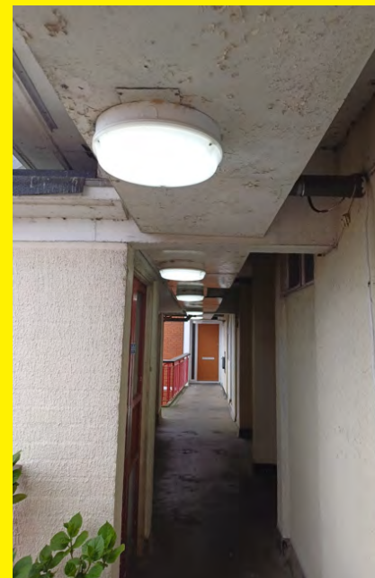
Emergency lighting at 11-84 Medway Court.

Emergency lighting provides illumination in instances where mains power may have failed. It illuminates escape routes, emergency exit/s and firefighting equipment. It will provide illumination to signage and provide sufficient lighting to help you to escape.