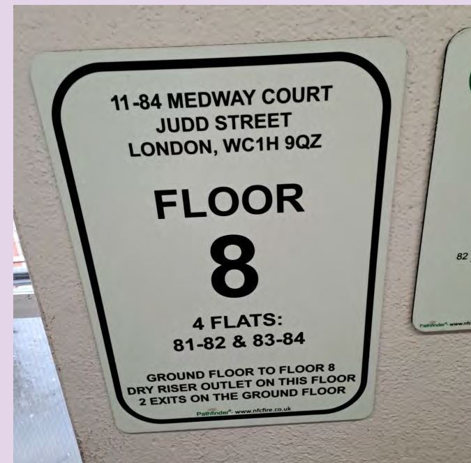
Wayfinding signage at 11-84 Medway Court.

Wayfinding signage is a visual communication tool to assist the Fire and Rescue Service in locating specific flats as they navigate their way round a building.