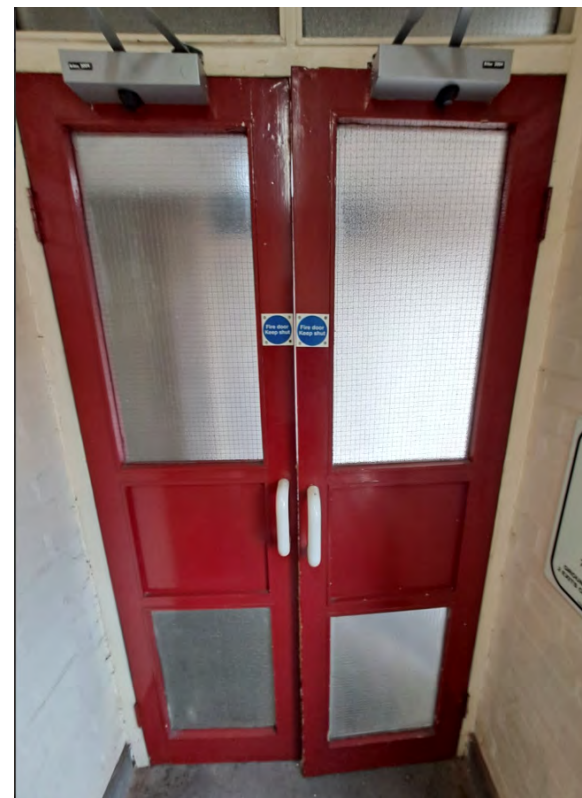
Communal Fire Door at 11-84 Medway Court.