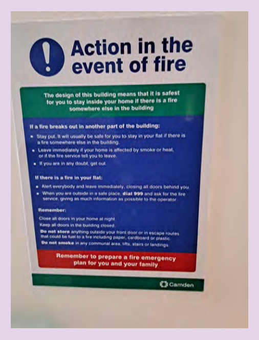
Fire Action Notice at Oxenholme.

We have installed Fire Action Notices and Fire Exit Signs in your building.