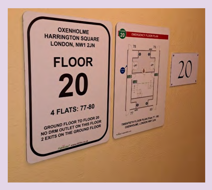
Various wayfinding signage at Oxenholme.

Wayfinding signage is a visual communication tool to assist the Fire and Rescue Service in locating specific flats as they navigate their way round a building.