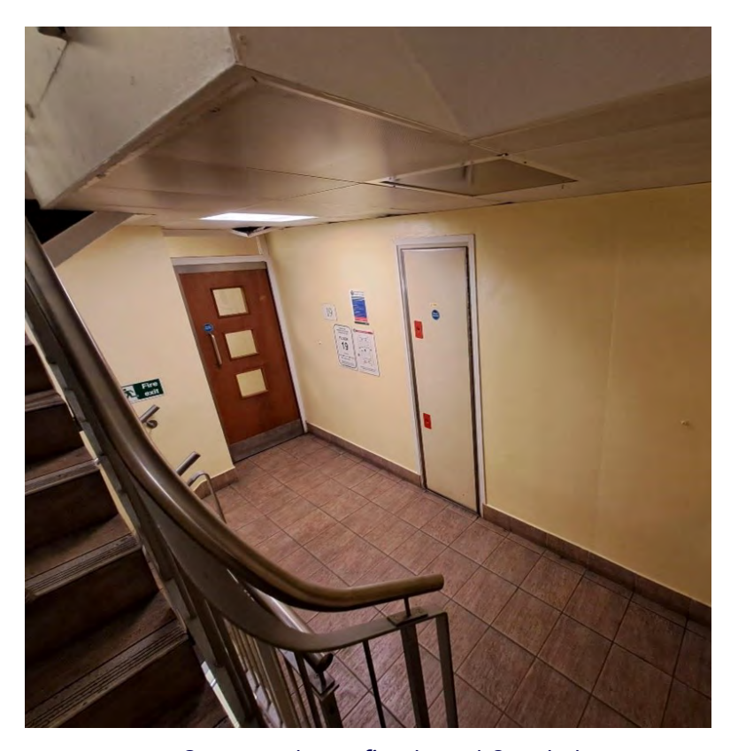
Communal area fire door at Oxenholme.