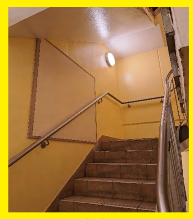
Emergency lighting at Oxenholme.

The lighting should illuminate all escape routes, emergency exit/s and firefighting equipment.