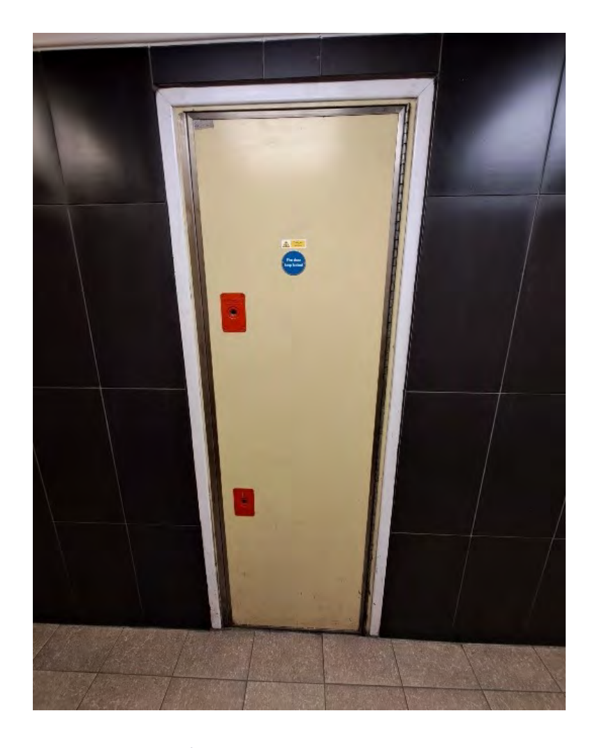
Fire door at Oxenholme.