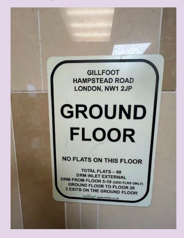
Ground floor wayfinding signage at Gilfoot.

Wayfinding signage is a visual communication tool to assist the Fire and Rescue Service in locating specific flats as they navigate their way round a building.