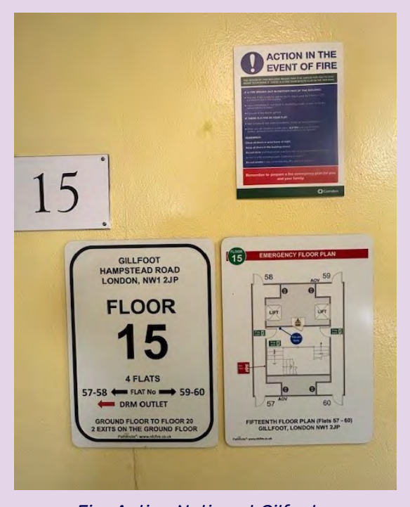
Fire Action Notice at Gilfoot.

We have installed Fire Action Notices and Fire Exit Signs in your building.