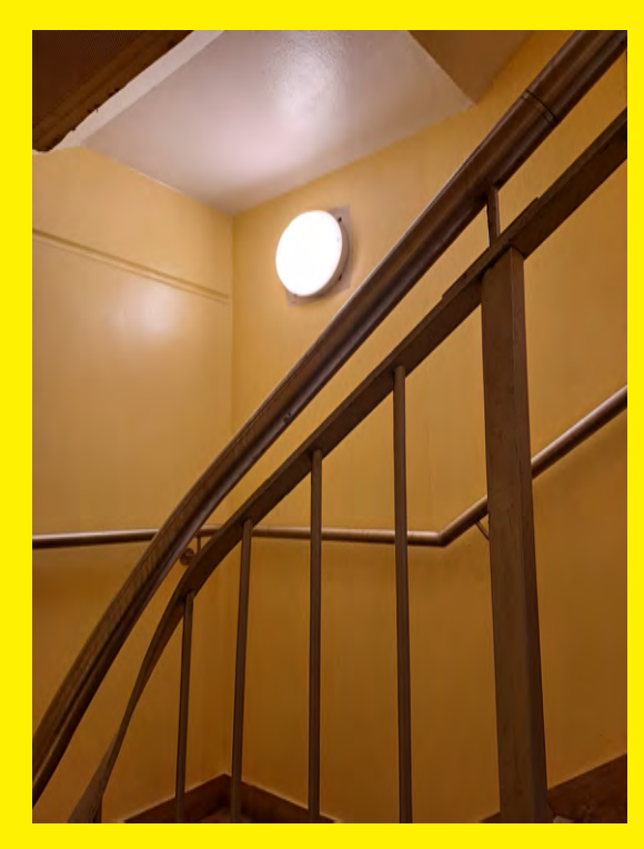
Stairwell emergency lighting at Gilfoot.

An emergency lighting system is generally comprised of selfcontained 3hr battery back-up-maintained LED luminaires.