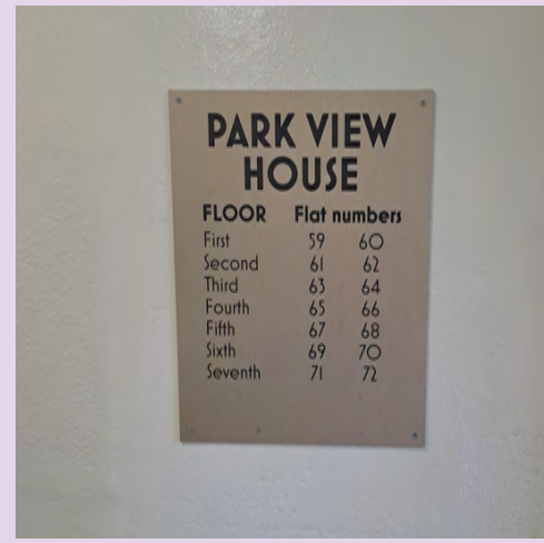
Various wayfinding signage at Park View House.

Wayfinding signage is located on each stairwell landing and by the main entrance.