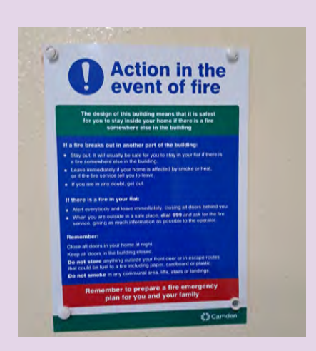
Fire Action Notice beside lift at Park View House.

We have installed Fire Action Notices in your building.