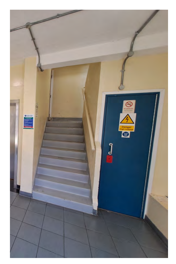
Electrical cupboard fire door at Park View House.