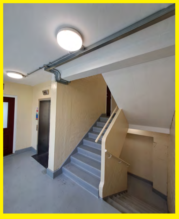
Emergency lighting at Park View House

Emergency lighting provides illumination in instances where mains power may have failed. It illuminates escape routes, emergency exit/s and firefighting equipment. It will provide illumination to signage and provide sufficient lighting to help you to escape.