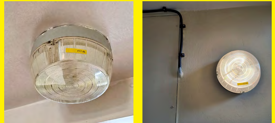
Emergency lighting at Bucklebury.

An emergency lighting system is generally comprised of self-contained 3hr battery back-up-maintained LED luminaires.