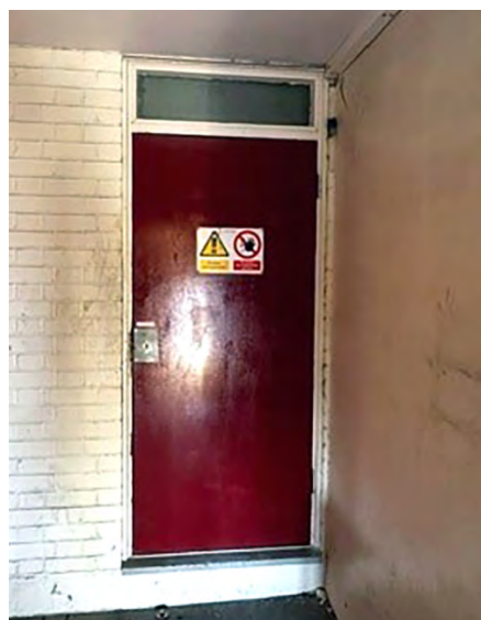
Cupboard Fire Doors at Bucklebury.