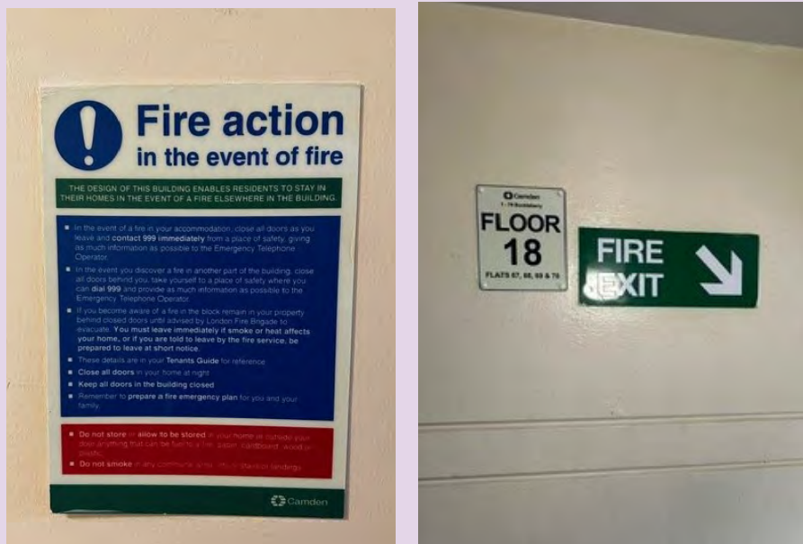
Fire Action Notice and Fire Exit Signage at Bucklebury.

We have installed Fire Action Notices and Fire Exit Signs in your building.