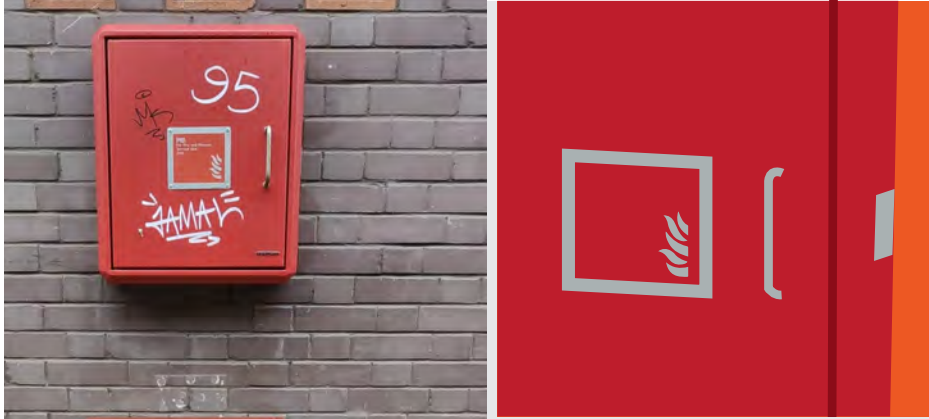
Secure Information Box at Bucklebury.

Secure Information Boxes are easily identifiable storage units for documents intended for use by the fire and rescue service during a fire.