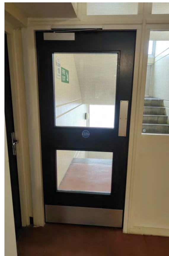
Communal Fire Door at Bucklebury.