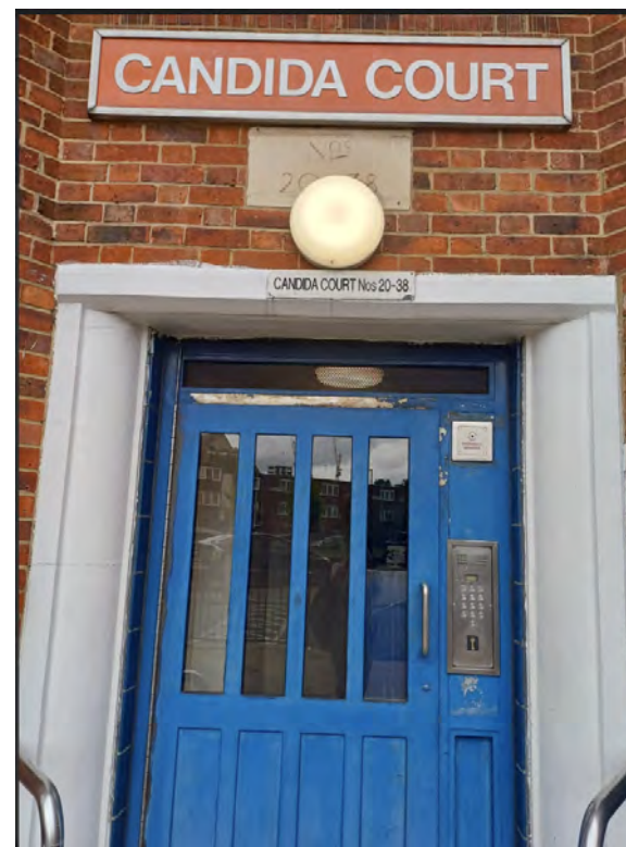
Communal Fire Door at Candida Court.