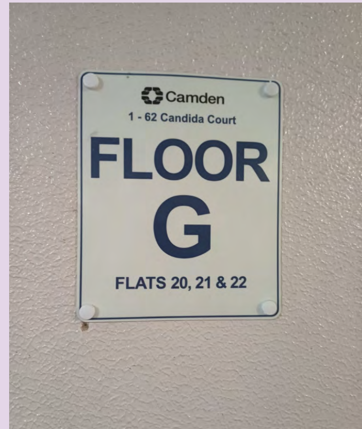
Wayfinding signage at Candida Court

Wayfinding signage is a visual communication tool to assist the Fire and Rescue Service in locating specific flats as they navigate their way round a building.