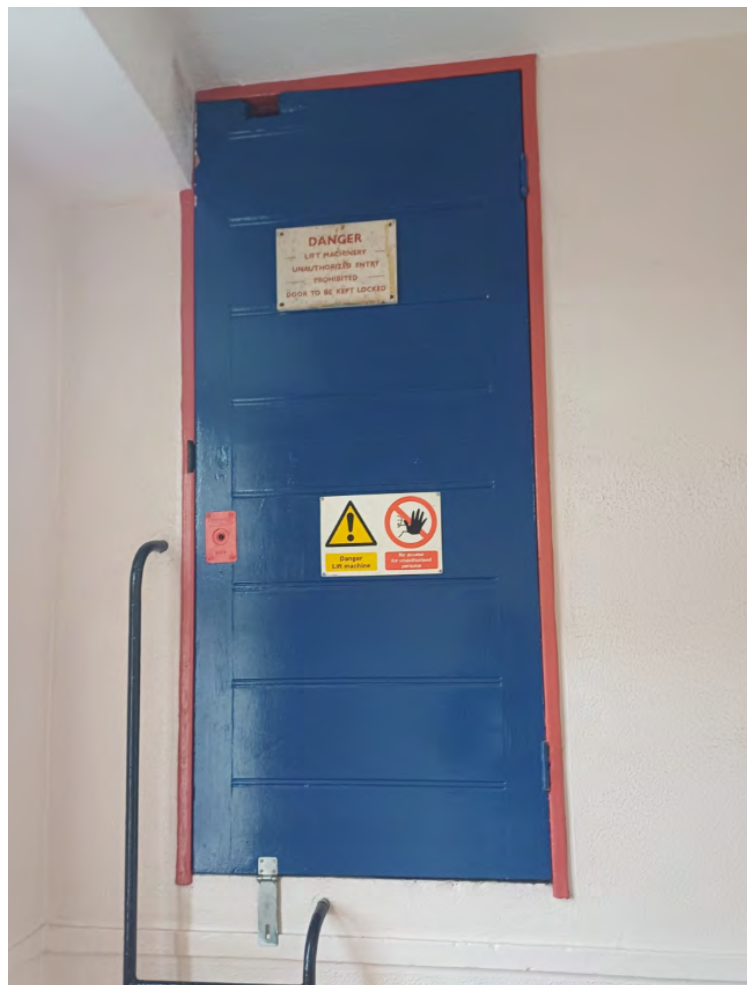
Lift Room Fire Door at Candida Court.

Doors to plant rooms, electrical intake and lift motor rooms (including fire rated hatches or panels)