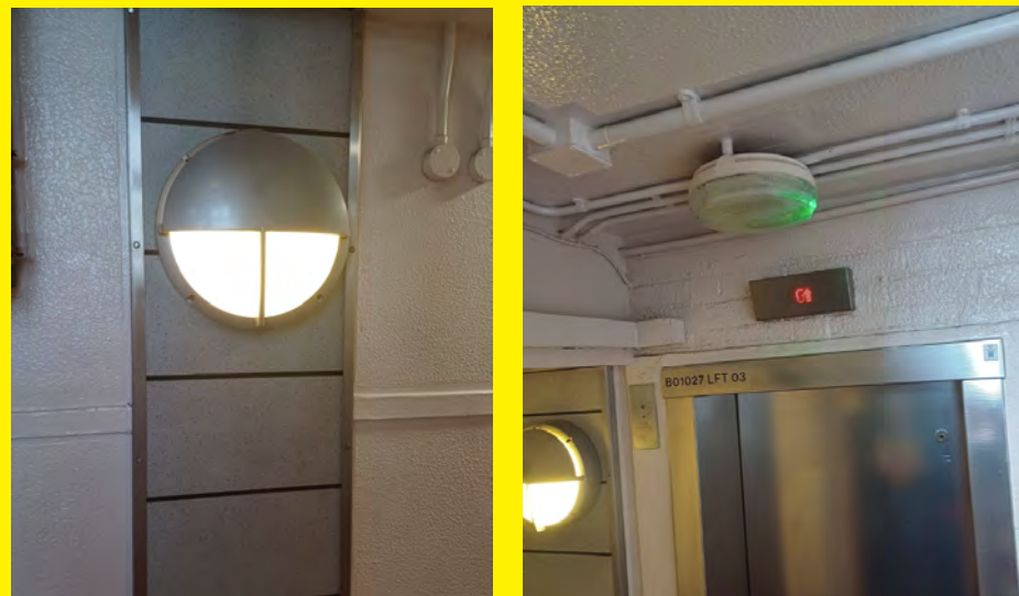
Emergency lighting at Candida Court.

Emergency lighting provides illumination in instances where mains power may have failed. It illuminates escape routes, emergency exit/s and firefighting equipment. It will provide illumination to signage and provide sufficient lighting to help you to escape.