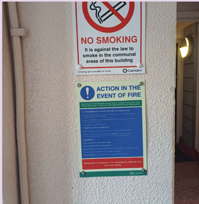
Fire Action Notice at Candida Court.

We have installed Fire Action Notices in your building.