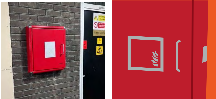
Secure Information Box at 1-50 Monmouth House.

Secure Information Boxes are easily identifiable storage units for documents intended for use by the fire and rescue service during a fire.