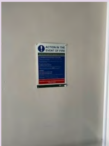
Fire Action Notice at 1-50 Monmouth House.

We have installed Fire Action Notices and Fire Exit Signs in your building.