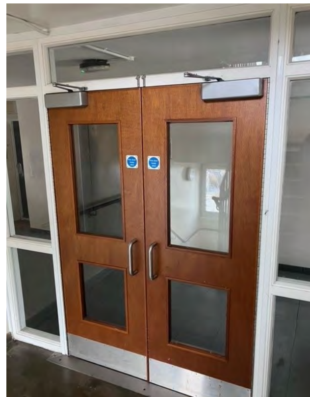
Communal Fire Door at 1-50 Monmouth House.