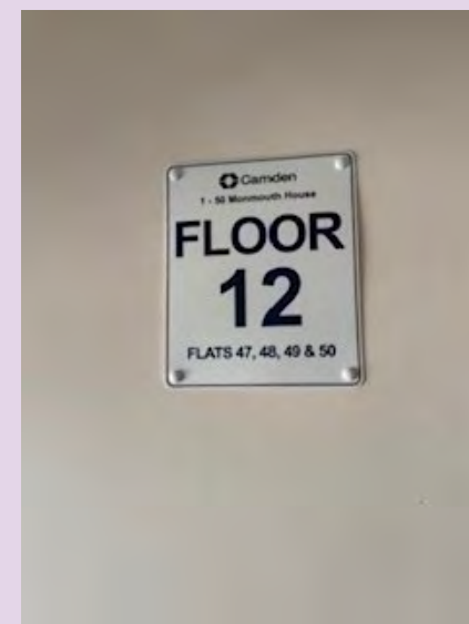
Wayfinding signage at 1-50 Monmouth House.

Wayfinding signage is a visual communication tool to assist the Fire and Rescue Service in locating specific flats as they navigate their way round a building.