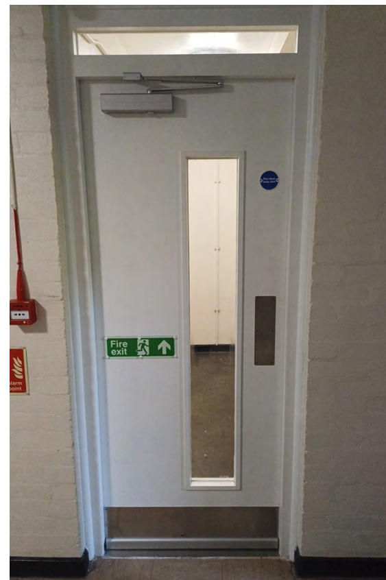
Communal Fire Door at 1-44 Langdon House.