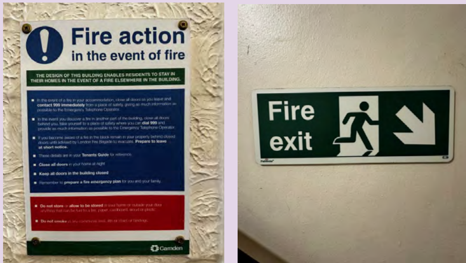
Fire Action Notice and Fire Exit Sign at 1-44 Langdon House.

We have installed Fire Action Notices and Fire Exit Signs in your building.