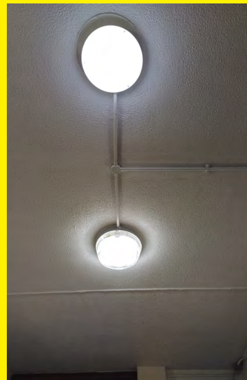
Emergency lighting at 1-44 Langdon House.

Emergency lighting provides illumination in instances where mains power may have failed. It illuminates escape routes, emergency exit/s and firefighting equipment. It will provide illumination to signage and provide sufficient lighting to help you to escape.