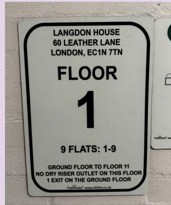
Wayfinding signage at 1-44 Langdon House.

Wayfinding signage is a visual communication tool to assist the Fire and Rescue Service in locating specific flats as they navigate their way round a building.