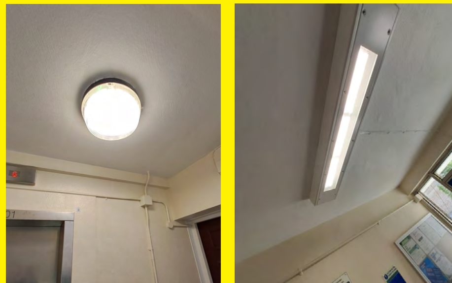
Emergency lighting at 1-44 Boswell House.

Emergency lighting provides illumination in instances where mains power may have failed. It illuminates escape routes, emergency exit/s and firefighting equipment. It will provide illumination to signage and provide sufficient lighting to help you to escape.