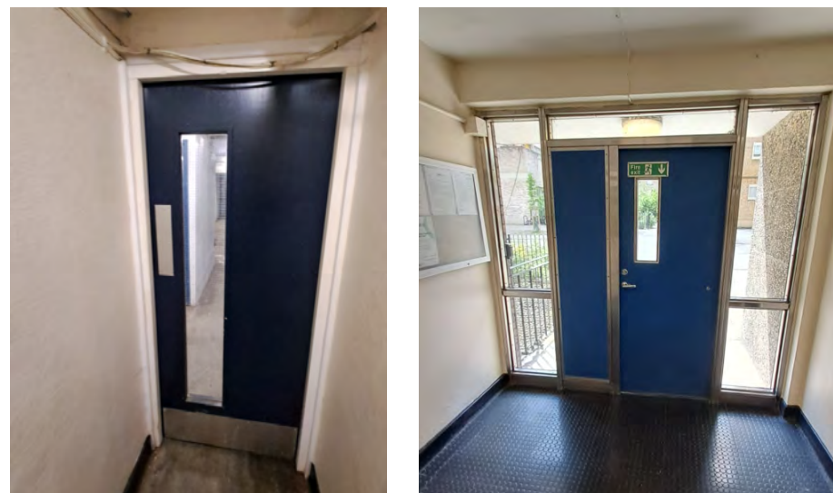
Communal Fire Doors at 1 - 44 Borrowdale.