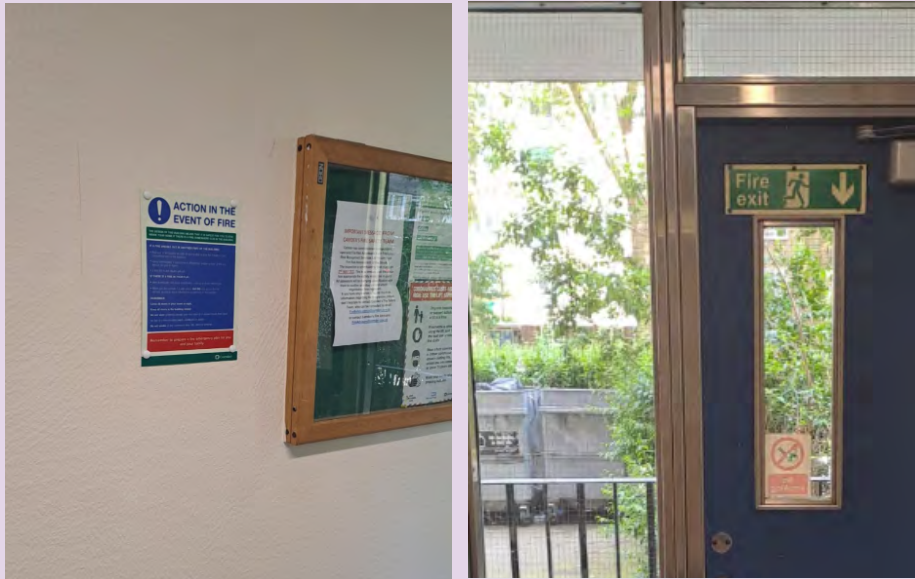
Fire Action Notice at 1-44 Borrowdale.

We have installed Fire Action Notices and Fire Exit Signs in your building.