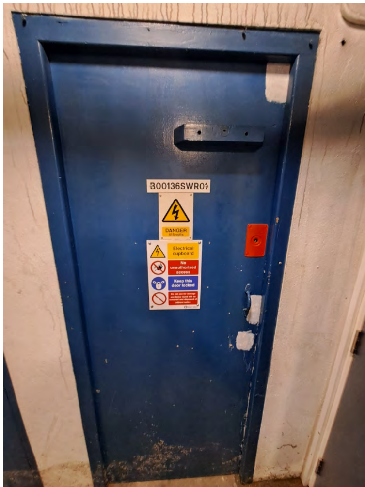
Electrical cupboard door at 1-44 Borrowdale.

Doors to plant rooms, electrical intake and lift motor rooms (including fire rated hatches or panels)