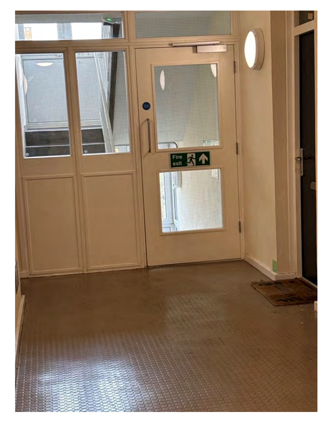
Communal Fire Door at 1-43 Grange Mill.