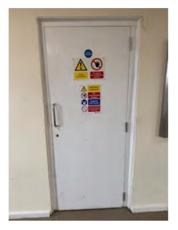
Plant Room Fire Door at 1-43 Grange Mill.

Doors to plant rooms, electrical intake and lift motor rooms (including fire rated hatches or panels)