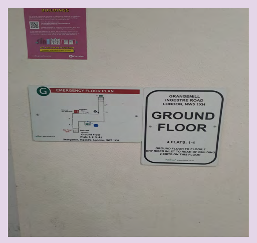
Emergency floor plan and level wayfinding signage in communal area at 1-43 Grange Mill.

Wayfinding signage is a visual communication tool to assist the Fire and Rescue Service in locating specific flats as they navigate their way round a building.