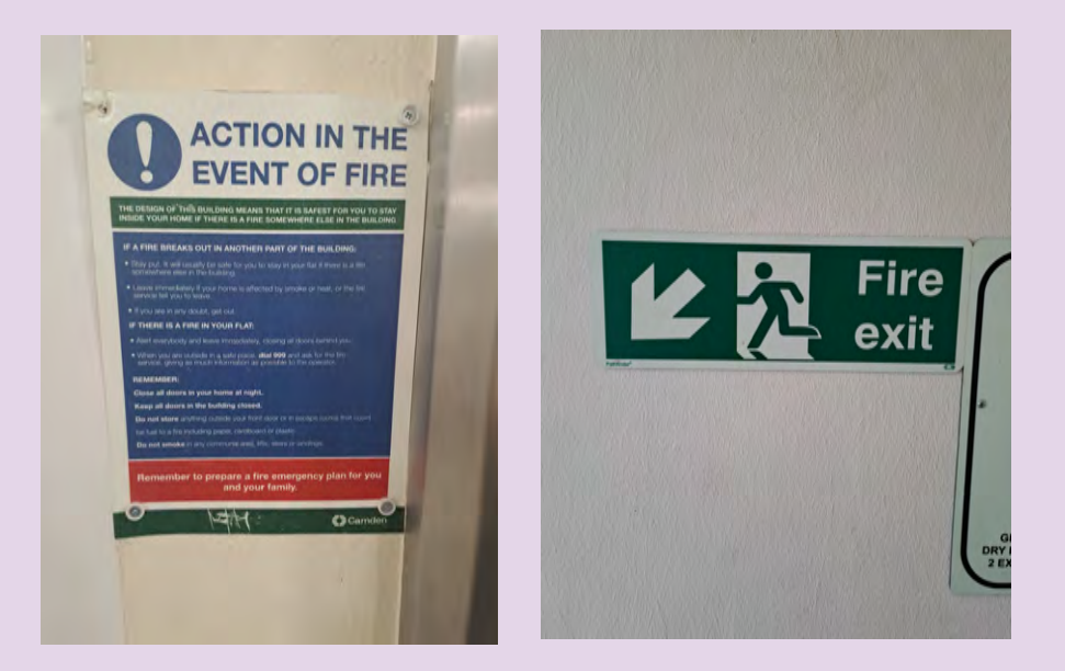
Fire Action Notice and Fire Exit Signs at 1-43 Grange Mill.

We have installed Fire Action Notices and Fire Exit Signs in your building.