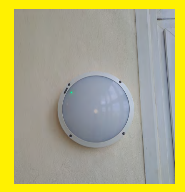
Emergency lighting at 1-43 Grange Mill.

An emergency lighting system is generally comprised of selfcontained 3hr battery back-up-maintained LED luminaires.