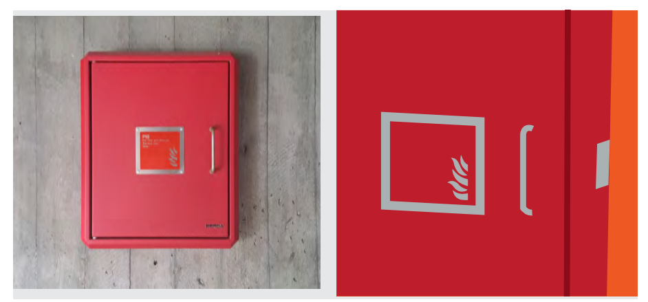
Secure Information Box at 1-43 Grange Mill .

Secure Information Boxes are easily identifiable storage units for documents intended for use by the fire and rescue service during a fire.