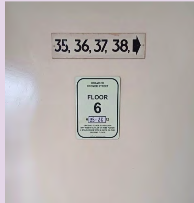
Wayfinding signage at 1-38 Bramber.

Wayfinding signage is a visual communication tool to assist the Fire and Rescue Service in locating specific flats as they navigate their way round a building.