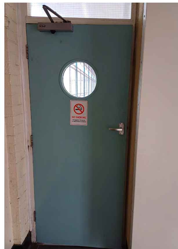
Communal Fire Door at 1-38 Bramber.