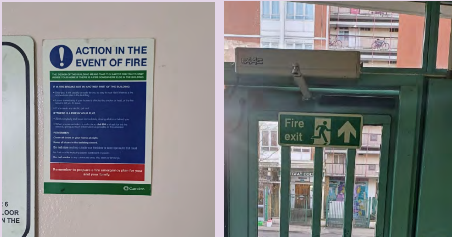
Fire Action Notice and Fire Exit Sign at 1-38 Bramber.

We have installed Fire Action Notices and Fire Exit Signs in your building.