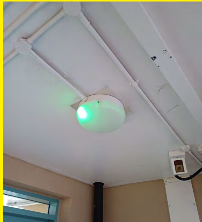
Emergency lighting at 1-38 Bramber.

Emergency lighting provides illumination in instances where mains power may have failed. It illuminates escape routes, emergency exit/s and firefighting equipment. It will provide illumination to signage and provide sufficient lighting to help you to escape.