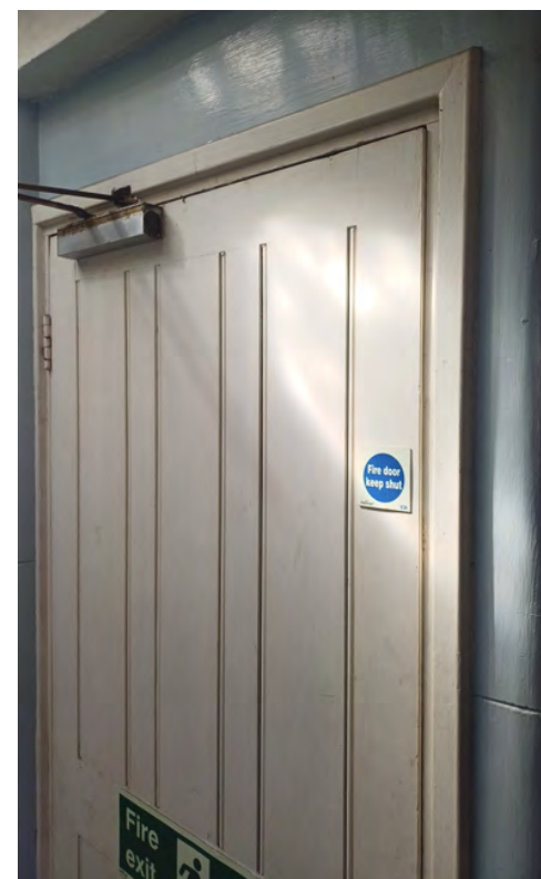
Communal Fire Door at 1-30 Winston.