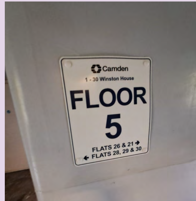
Wayfinding signage at 1-30 Winston

Wayfinding signage is a visual communication tool to assist the Fire and Rescue Service in locating specific flats as they navigate their way round a building.