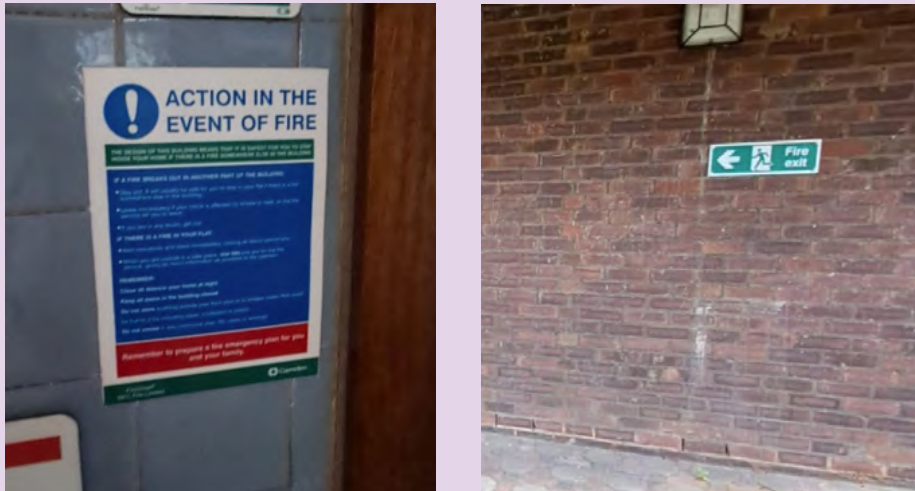
Fire Action Notice and Fire Exit Sign at 1-30 Winston.

We have installed Fire Action Notices and Fire Exit Signs in your building.