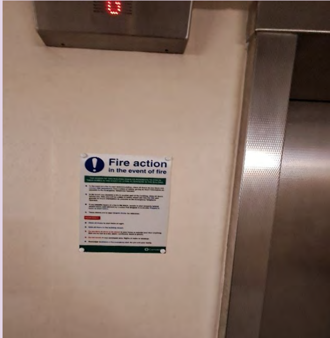
Fire action notice at Bray Tower.

We have installed fire action notices and fire exit signs in your building.