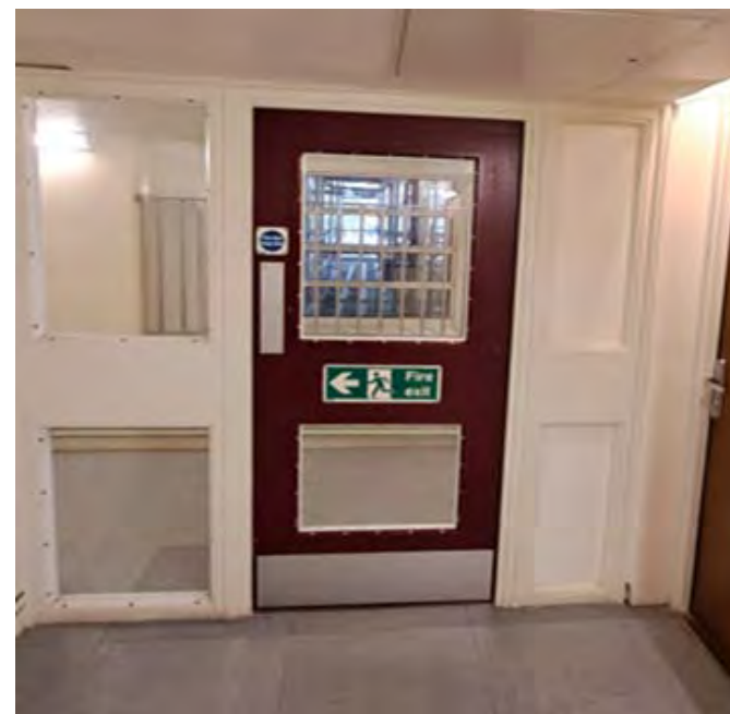
Communal fire door at Bray Tower.