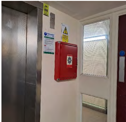
Secure Information Box at Bray Tower.

If you need help in the event of an emergency such as a fire, due to a physical disability or long term medical condition or another disorder, please let us know.