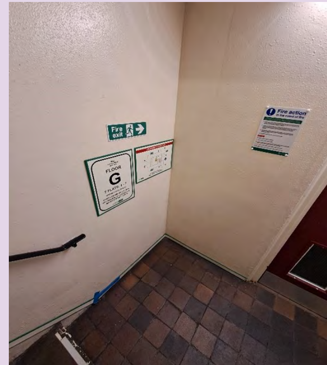
Wayfinding signage and fire exit signage in stairwell at Bray Tower.

Wayfinding signage is a visual communication tool to assist the Fire and Rescue Service in locating specific flats as they navigate their way round a building.