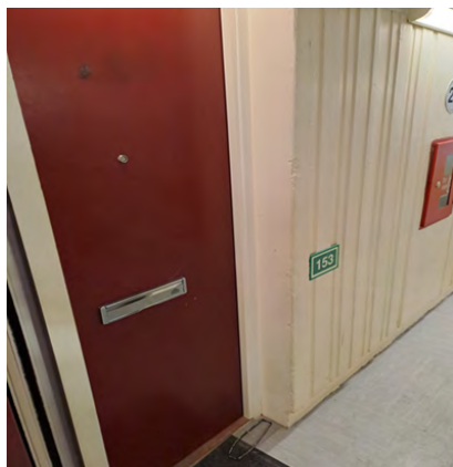
Front entrance door at Bray Tower.

In your building, the doors into corridors, hallways and stairwells are fire doors. Your front door may be a fire door.