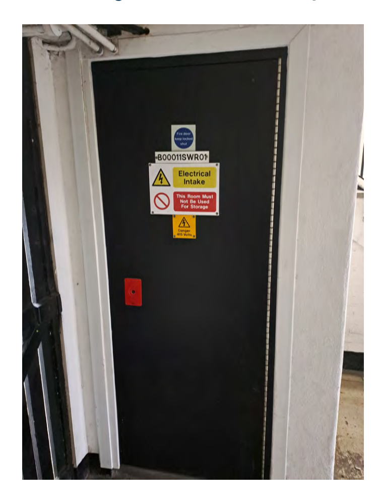
Electrical Intake Cupboard Fire Door at 1-29 Faversham House.