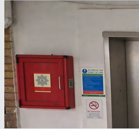
Secure Information Box at 1-29 Faversham House.

If you need help in the event of an emergency such as a fire, due to a physical disability or long term medical condition or another disorder, please let us know.