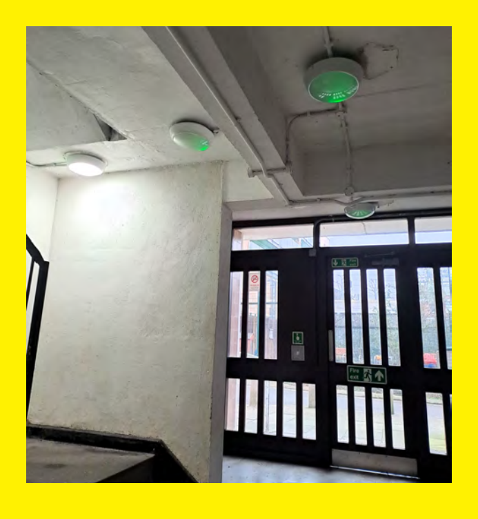
Emergency lighting at 1-29 Faversham House.

An emergency lighting system is generally comprised of selfcontained 3hr battery back-up-maintained LED luminaires.