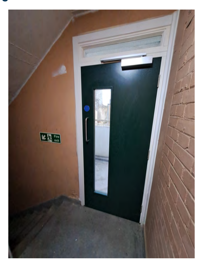
Communal Fire door at 1-29 Faversham House.