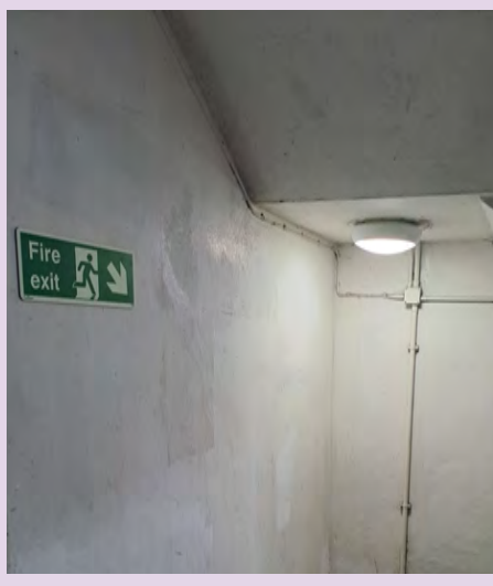
Fire Action Notice and Fire Exit Sign at 1-29 Faversham House.