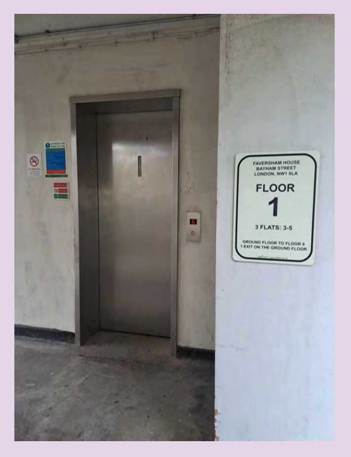
Wayfinding signage at 1-29 Faversham House.

Wayfinding signage is a visual communication tool to assist the Fire and Rescue Service in locating specific flats as they navigate their way round a building.