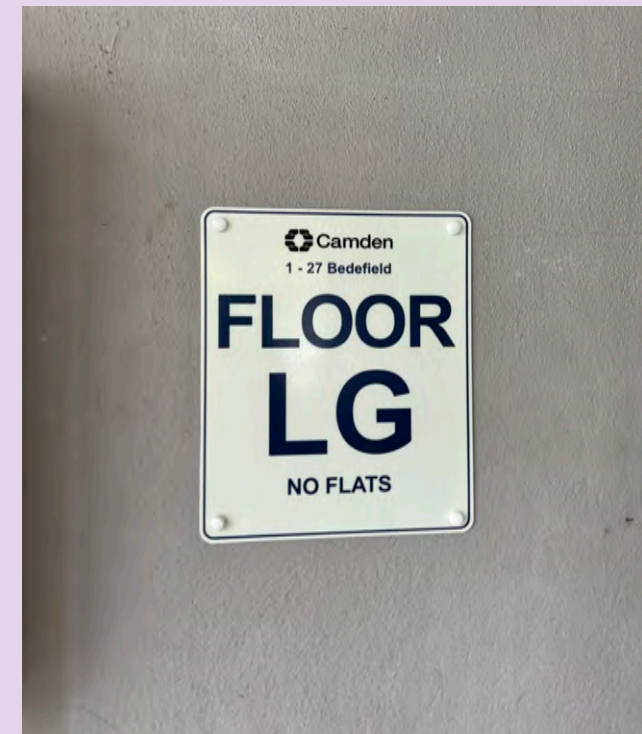
Wayfinding signage at 1-27 Bedefield .

Wayfinding signage is a visual communication tool to assist the Fire and Rescue Service in locating specific flats as they navigate their way round a building.