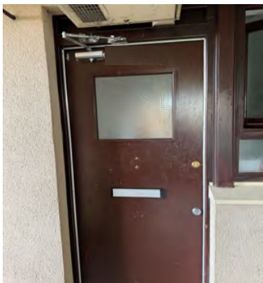
Front Entrance Door at 1-27 Bedefield.

There are communal fire doors in this building. Your front door may be a fire door.