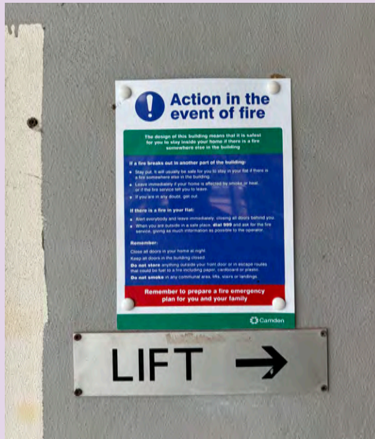
Fire action notice at 1-27 Bedefield .

We have installed fire action notices in your building.