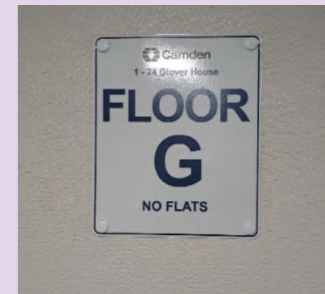
Wayfinding signage at Glover House.

At Glover House, wayfinding signage is located on each floor in the stairwells and in the lift lobby.