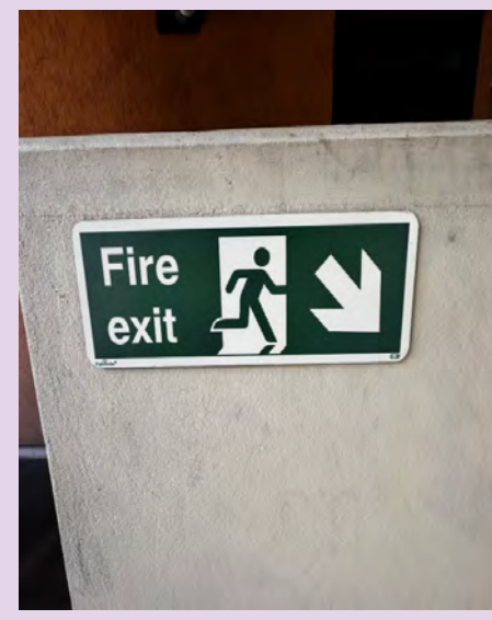
Fire action notice and fire exit sign at 1-24 Chadswell.