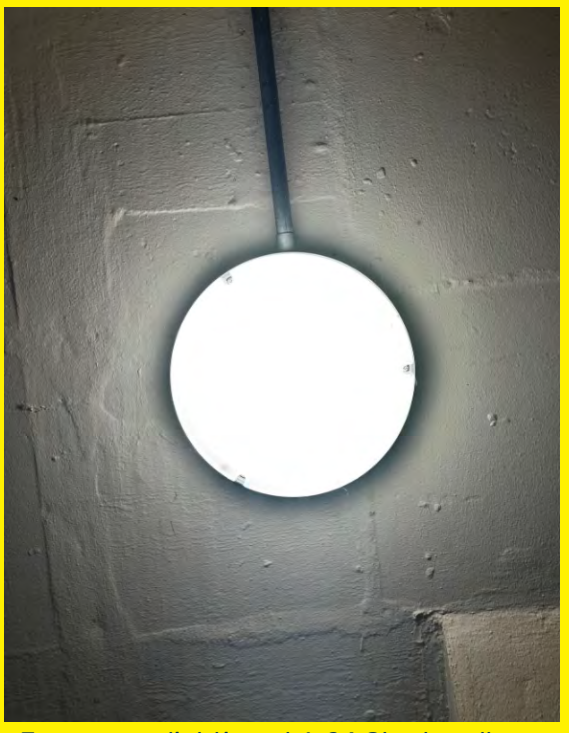
Emergency lighting at 1-24 Chadswell.

Emergency lighting provides illumination in instances where mains power may have failed. It illuminates escape routes, emergency exit/s and firefighting equipment. It will provide illumination to signage and provide sufficient lighting to help you to escape.