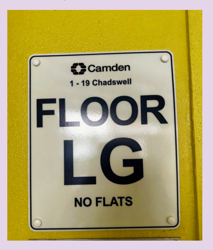
Wayfinding signage at 1-24 Chadswell.

Wayfinding signage is a visual communication tool to assist the Fire and Rescue Service in locating specific flats as they navigate their way round a building.