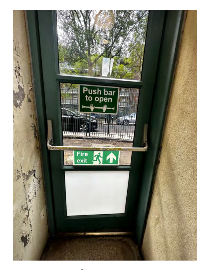
Communal fire door at 1-24 Chadswell.