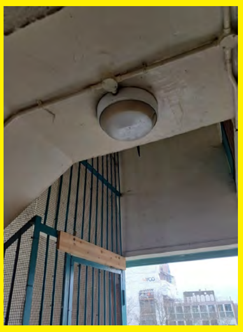
Emergency lighting at 1-19 Peperfield.

Emergency lighting provides illumination in instances where mains power may have failed. It illuminates escape routes, emergency exit/s and firefighting equipment. It will provide illumination to signage and provide sufficient lighting to help you to escape.