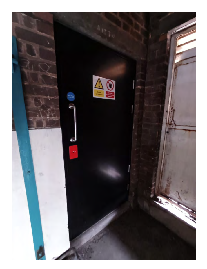
Lift Motor Room Fire Door at 1-19 Peperfield.