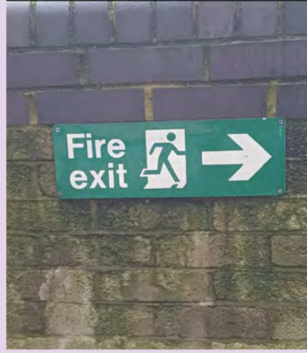
Fire Action Notice ad Fire Exit Sign at 1-19 Peperfield.