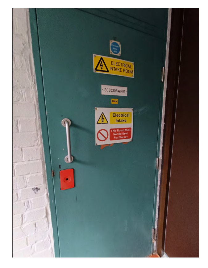
Electrical Intake Room Fire Door at Peperfield.