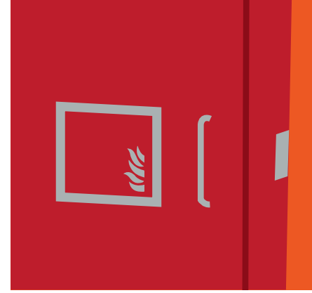
Secure Information Box at 1-19 Peperfield.

If you need help in the event of an emergency such as a fire, due to a physical disability or long term medical condition or another disorder, please let us know.