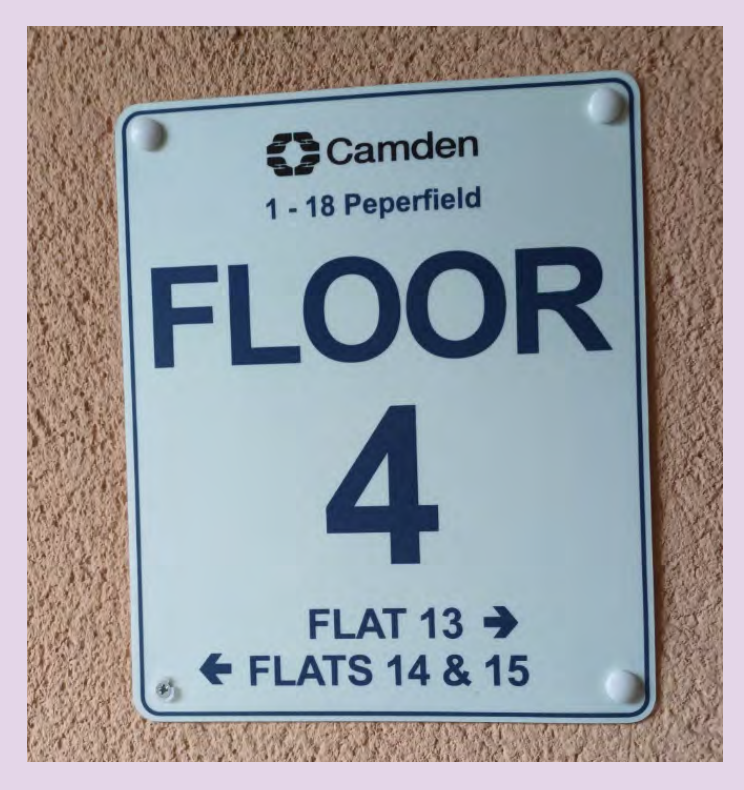
Wayfinding signage at 1-19 Peperfield.

Wayfinding signage is a visual communication tool to assist the Fire and Rescue Service in locating specific flats as they navigate their way round a building.