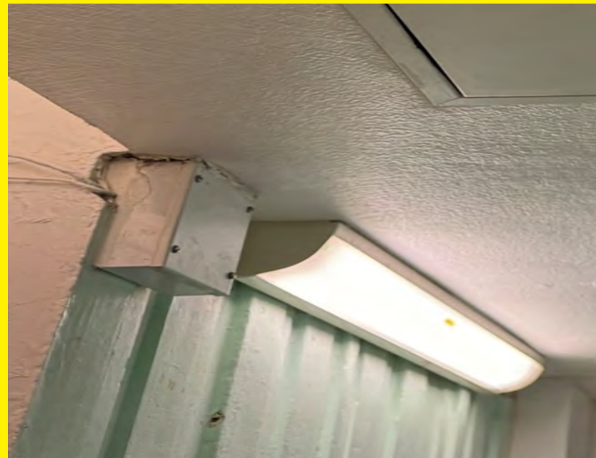
Emergency lighting at Taplow Tower.

Emergency lighting provides illumination in instances where mains power may have failed. It illuminates escape routes, emergency exit/s and firefighting equipment. It will provide illumination to signage and provide sufficient lighting to help you to escape.