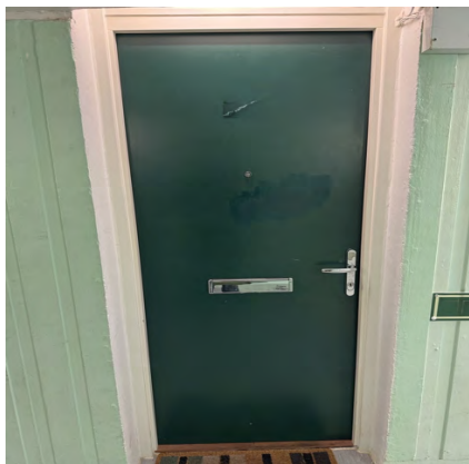
Front Entrance Door at Taplow Tower.

In your building, doors to the communal hallway, stairs, riser/ electrical cupboards and hatches are fire doors Your front door may be a fire door.