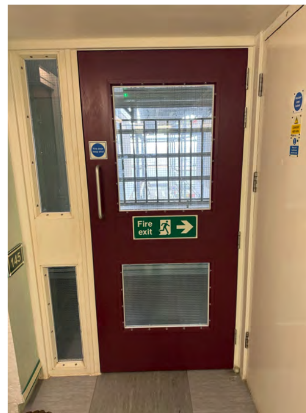
Communal area fire door at Taplow Tower.