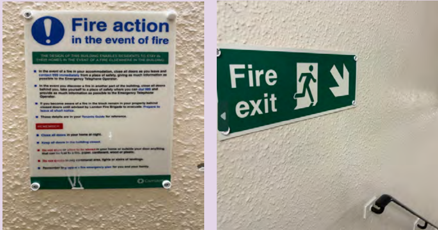
Fire Action Notices and Fire Exit Signs at Taplow Tower.

We have installed Fire Action Notices and Fire Exit signs in your building.