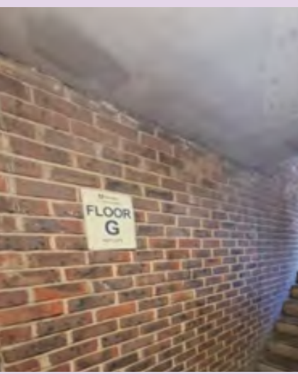
Various wayfinding signage at Southfleet.

Wayfinding signage at Southfleet is located at main entrances to the building, externally on brick stairwells on street level, in lift lobbies, and on stairwell exits to balconies.