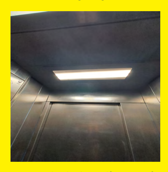
Emergency lighting in the lift at Southfleet.

Emergency lighting provides illumination in instances where mains power may have failed. It illuminates escape routes, emergency exit/s and firefighting equipment. It will provide illumination to signage and provide sufficient lighting to help you to escape.