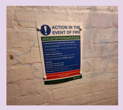
Fire Action Notice at Southfleet.

We have installed Fire Action Notices and Fire Exit Signs in your building.