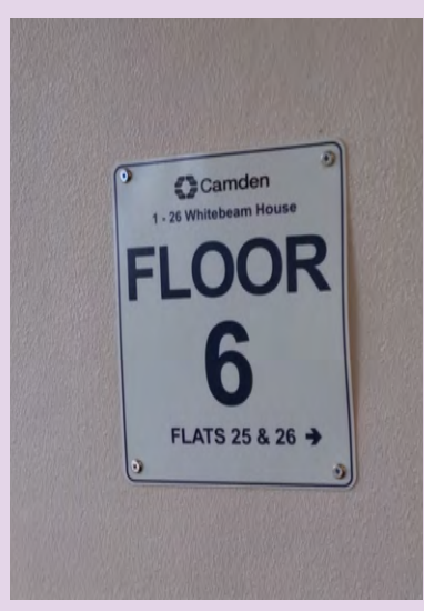
Various wayfinding signage at Whitebeam House.

Wayfinding signage at Whitebeam House can be found on the ground floor, in communal areas, and in stairwells.