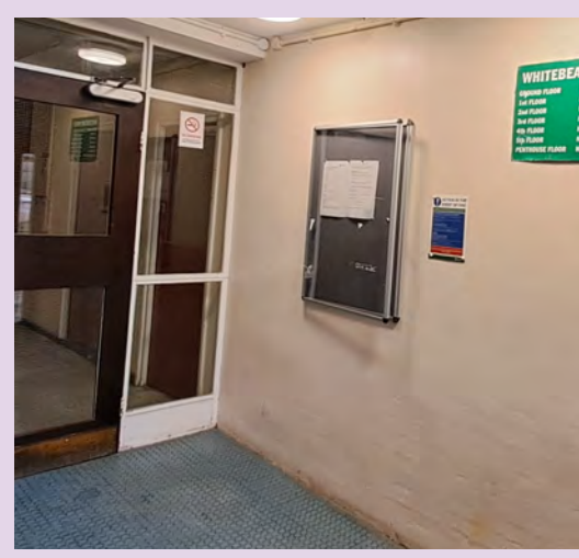
Fire action notice at Whitebeam House.