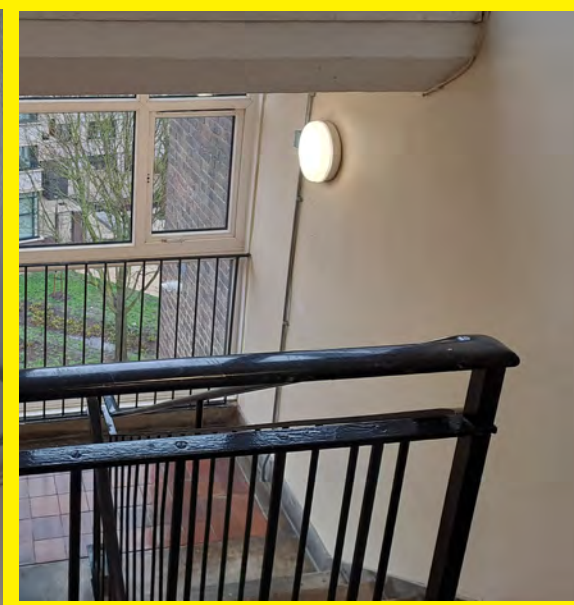
Wayfinding signage in stairwells at Whitebeam House.

Emergency lighting at Whitebeam House is located in stairwells and on communal landings.