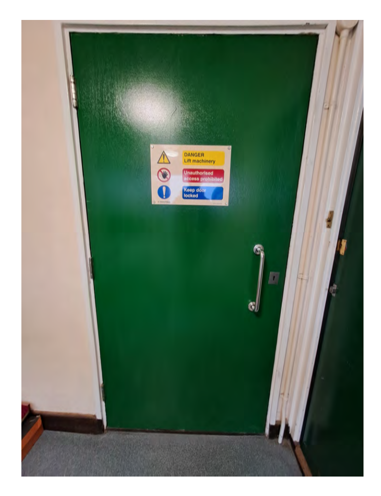
Lift Motor Room Fire Door at Whitebeam House.