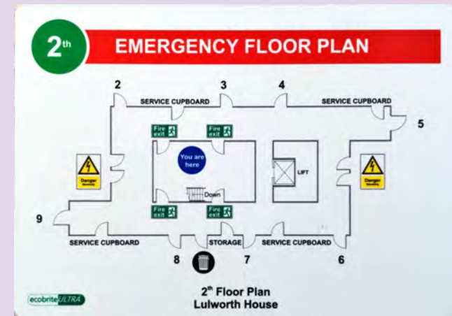
Various wayfinding signage at Lulworth Tower.

Wayfinding signage at Lulworth Tower is located on each stairwell landing and in communal corridors serving flats.