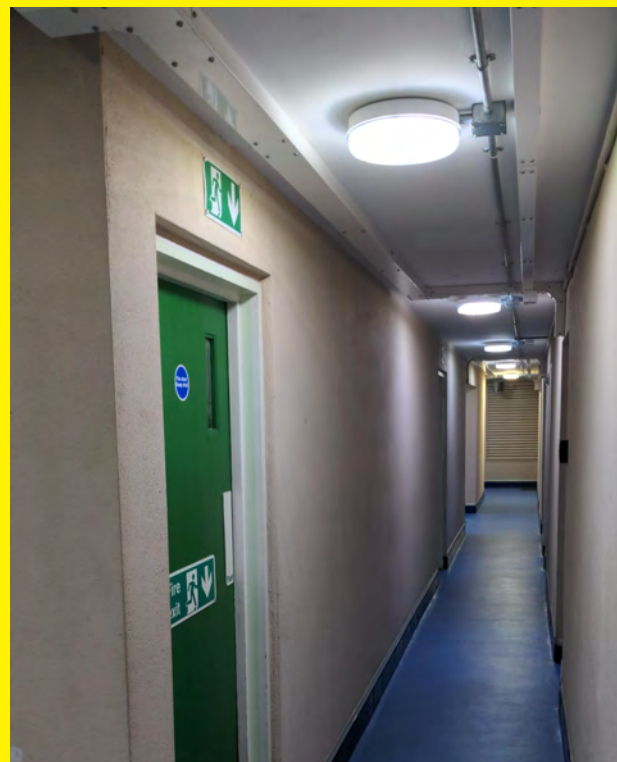
Emergency lighting at Lulworth Tower.

Emergency lighting provides illumination in instances where mains power may have failed. It illuminates escape routes, emergency exit/s and firefighting equipment. It will provide illumination to signage and provide sufficient lighting to help you to escape.