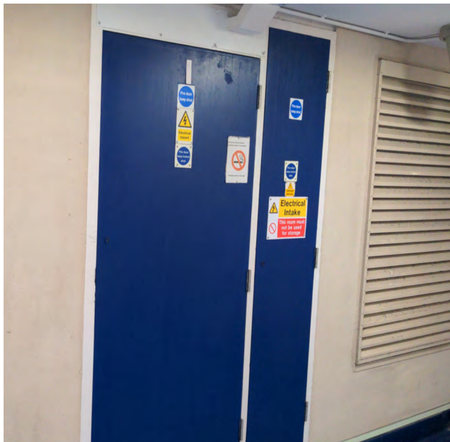
Electrical Intake Cupboard fire door at Lulworth Tower.

Doors to plant rooms, electrical intake and lift motor rooms (including fire rated hatches or panels)