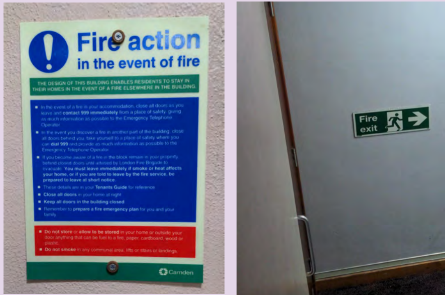
A Fire Action Notice and Fire Exit Signs at Lulworth Tower.

We have installed Fire Action Notices and Fire Exit Signs in your building.