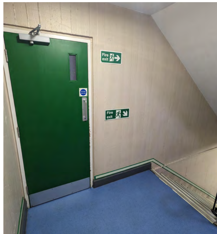
Communal fire door in stairwell at Lulworth Tower.