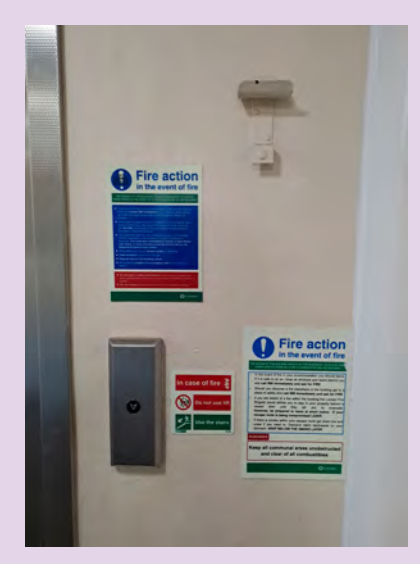
Fire Action Notices at Casterbridge.