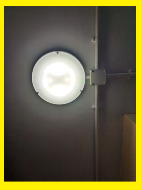
Emergency lighting at Casterbridge.

Emergency lighting provides illumination in instances where mains power may have failed. It illuminates escape routes, emergency exit/s and firefighting equipment. It will provide illumination to signage and provide sufficient lighting to help you to escape.