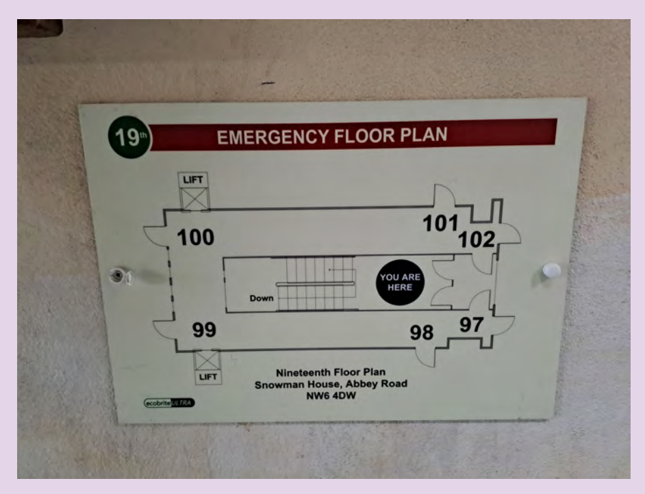
Wayfinding signage at Casterbridge.

Wayfinding signage is a visual communication tool to assist the Fire and Rescue Service in locating specific flats as they navigate their way round a building.