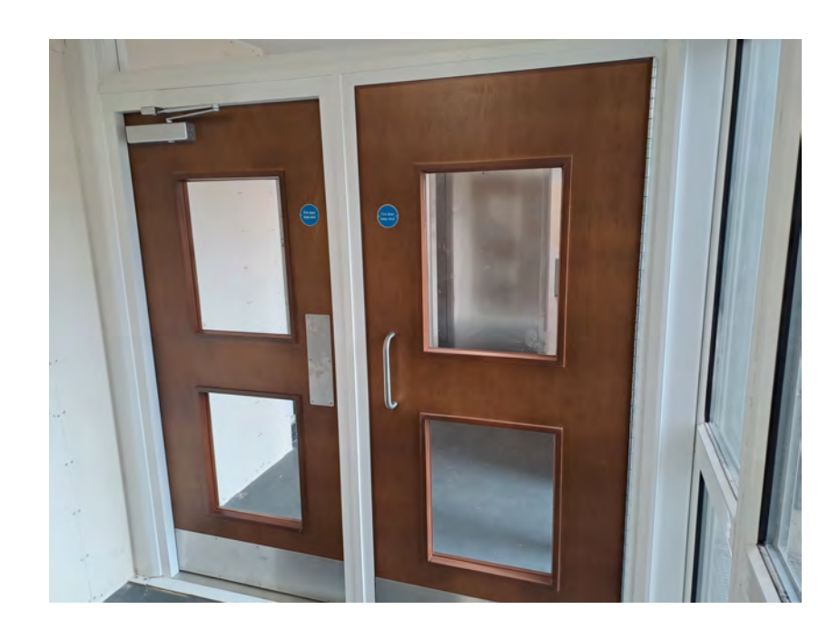
Communal Fire Doors at Casterbridge.