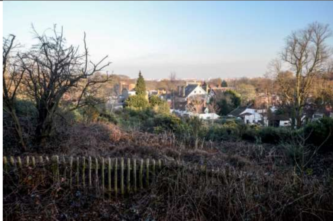
The view across the Vale of Health toward the City beyond

The foreground of Heath land gives way to the treed mid ground of the Vale of Health. The roof tops of the homes in the Vale are generally pitched and do not break the tree line so preserving the panorama uninterrupted. Tile and slate roofs are prevalent. Some of the upper levels include large mansards or flat roofs which are generally prominent and to be avoided. Large areas of glazing and / or full width dormers, plant and lift overruns as well as large areas of flat roof tend to detract from the view. Pitched roofs in slate or tile, roof lights and narrow dormers set below the roof apex are likely to cause less harm.