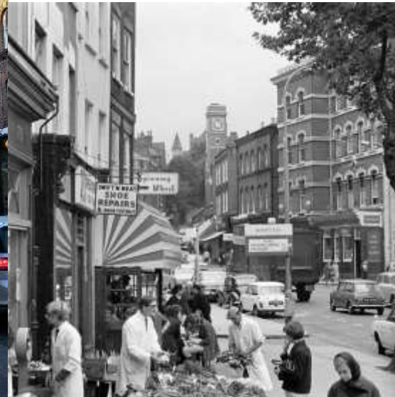
Similar view from 1972