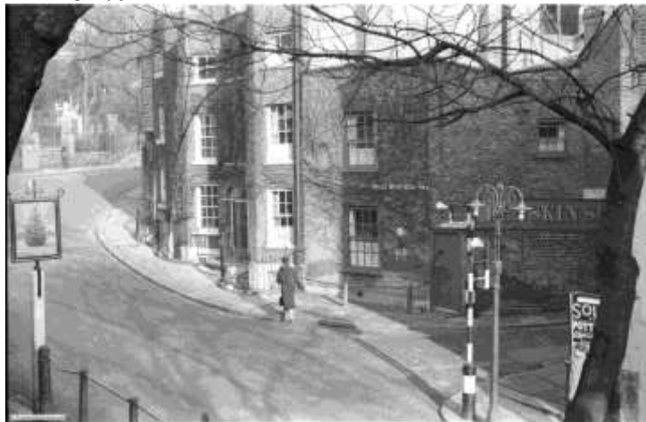
A similar view from 1949