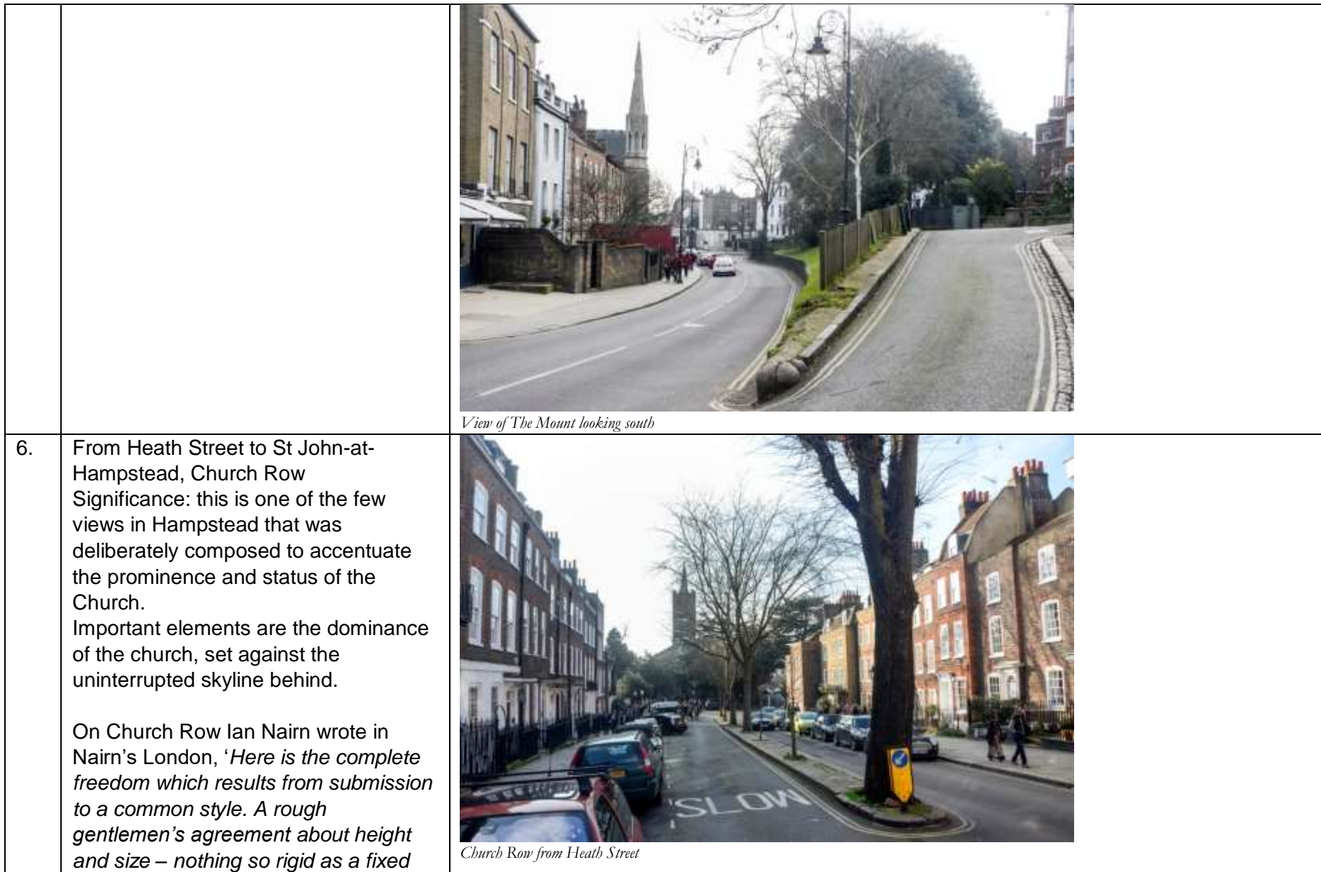
View of The Mount looking south