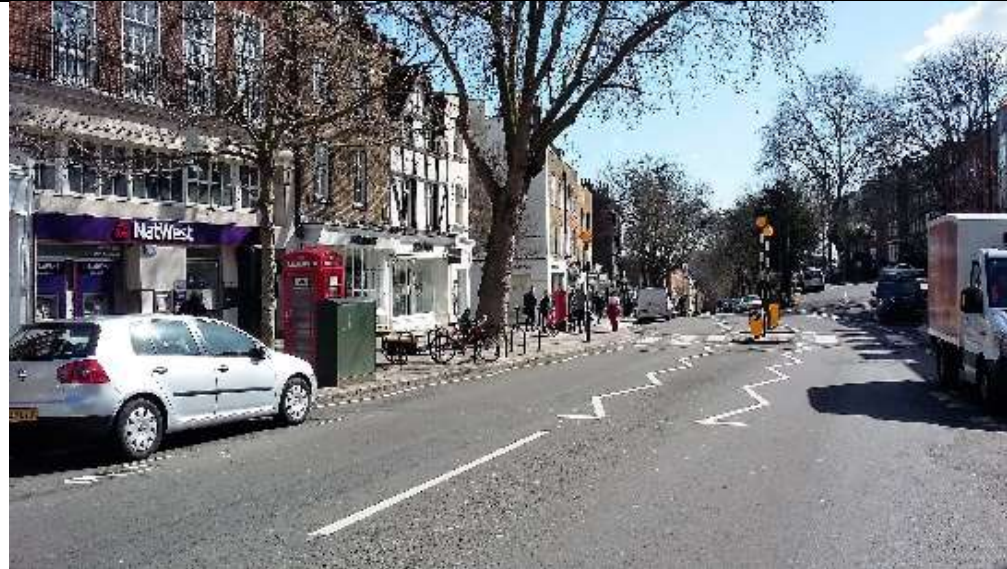
Looking east on High Street

Buildings are more varied in this part of the High Street, but the view highlights the attraction of the broadly consistent building heights.