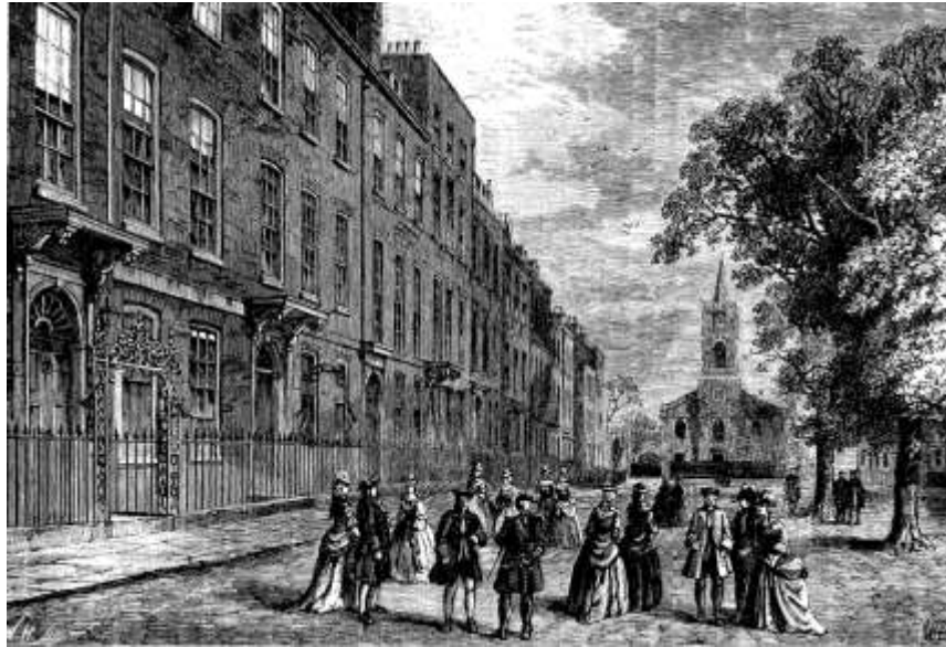
Similar view from 18 th century

The majority of the buildings in the view are listed. It is a setpiece in Hampstead and in London.