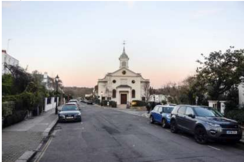
View approaching St John's, with Keat's Grove is to the right