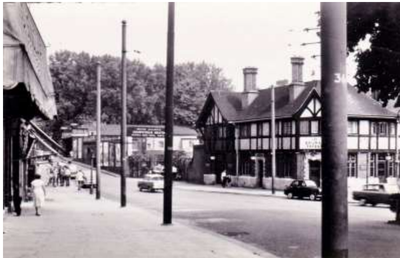
A similar view from the mid-20 th century