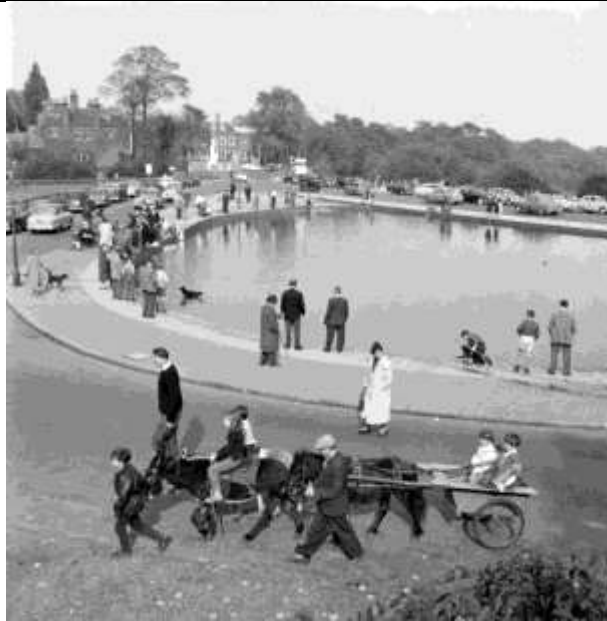
Similar view from the 1950s