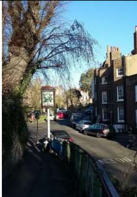
From slightly further back