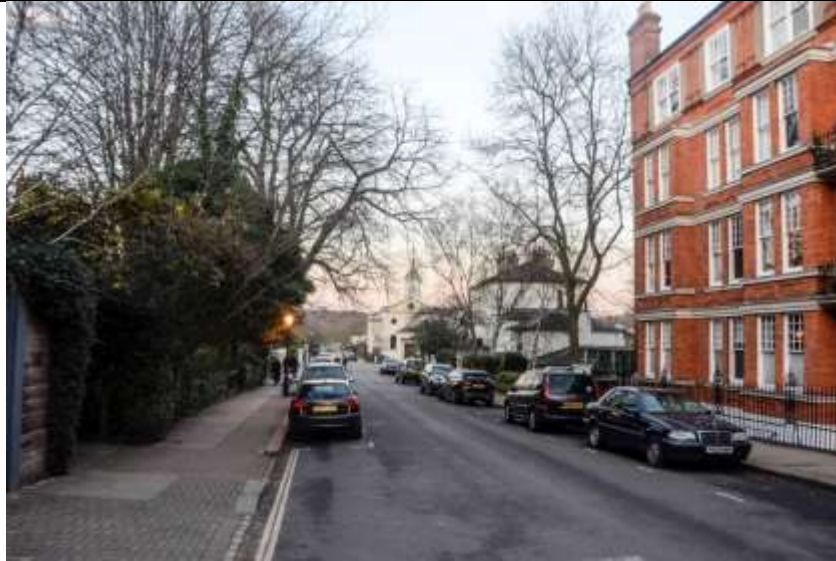
View of Downshire Hill, St John's and Heath in the distance

Important elements include the wide variety of well-designed and historic buildings, along with the street trees and those in the gardens of the houses.