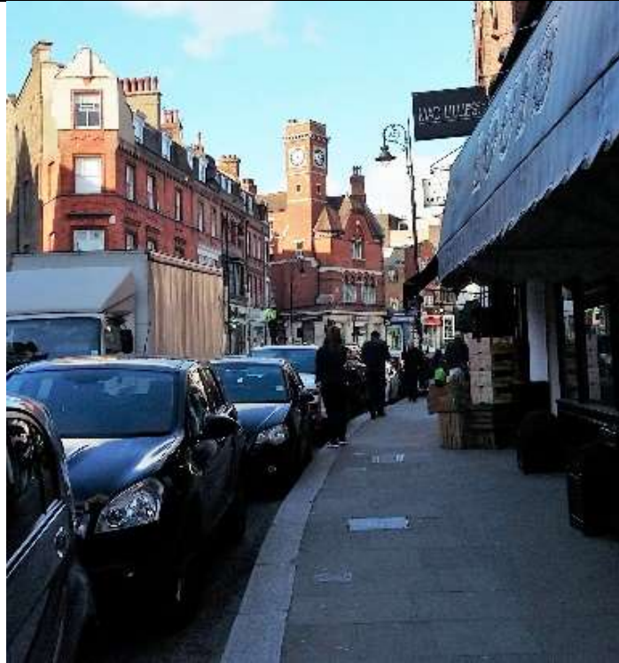
Looking north from Heath Street

and exhibit a regular parapet line with no visible roof level, typical of much of the High Street in this area.