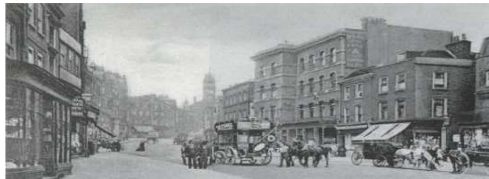
Similar view from 19 th century