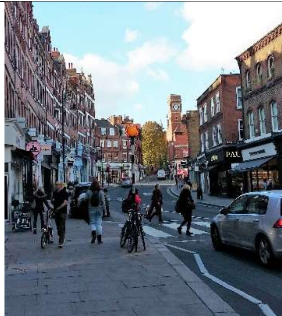
Looking west along High Street

Important elements include the subservience of the Victorian terraces and the clock tower itself. Mount Vernon Tower can be seen beyond the trees. The shopfronts generally consistent and of high quality, a general absence of amalgamation of shop units, vertical separation of shopfronts with mullions, consistent fascia size, cornices, pilasters and corbels. Red brick buildings dominate. Highly decorated on one side as a continuous terrace contrasting with individual