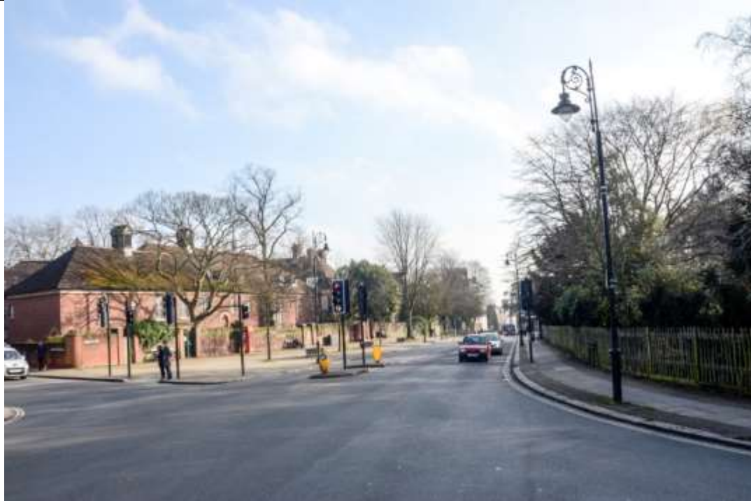
View looking south toward Heath Street, low-built Queen Mary's on left; green open space of Whitestone Gardens on right