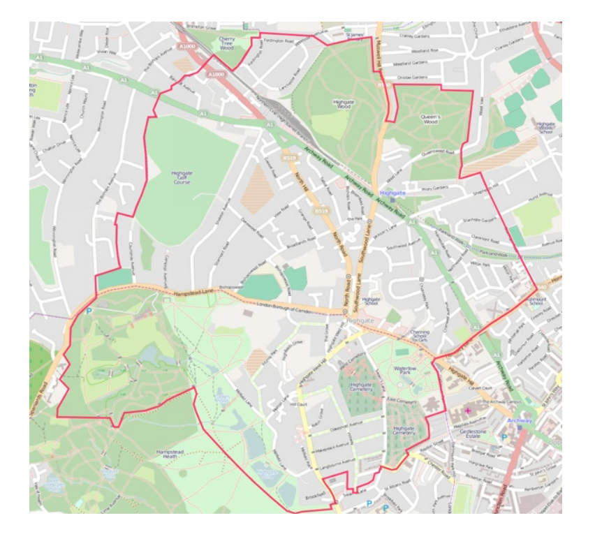
Figure 1: Highgate Neighbourhood Plan Area