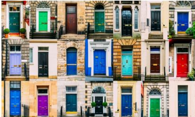
▲ In one door and out the other: but the promise of more 'flexible' renting, without the 'burden' of a tenancy agreement, comes at a cost

Rent from Lifestyle Club London and you are a 'member' ... and that's a whole new grey area