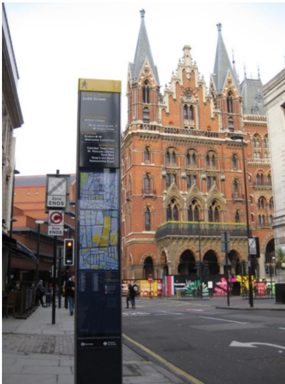
Figure W3: Legible London will continue to be rolled out in the Borough to improve wayfinding