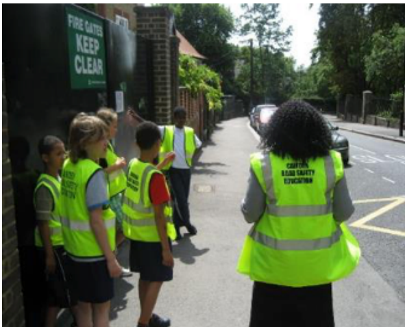
Figure W4: Pedestrian skills training for children in Camden forms a part of our road safety education and awareness programme