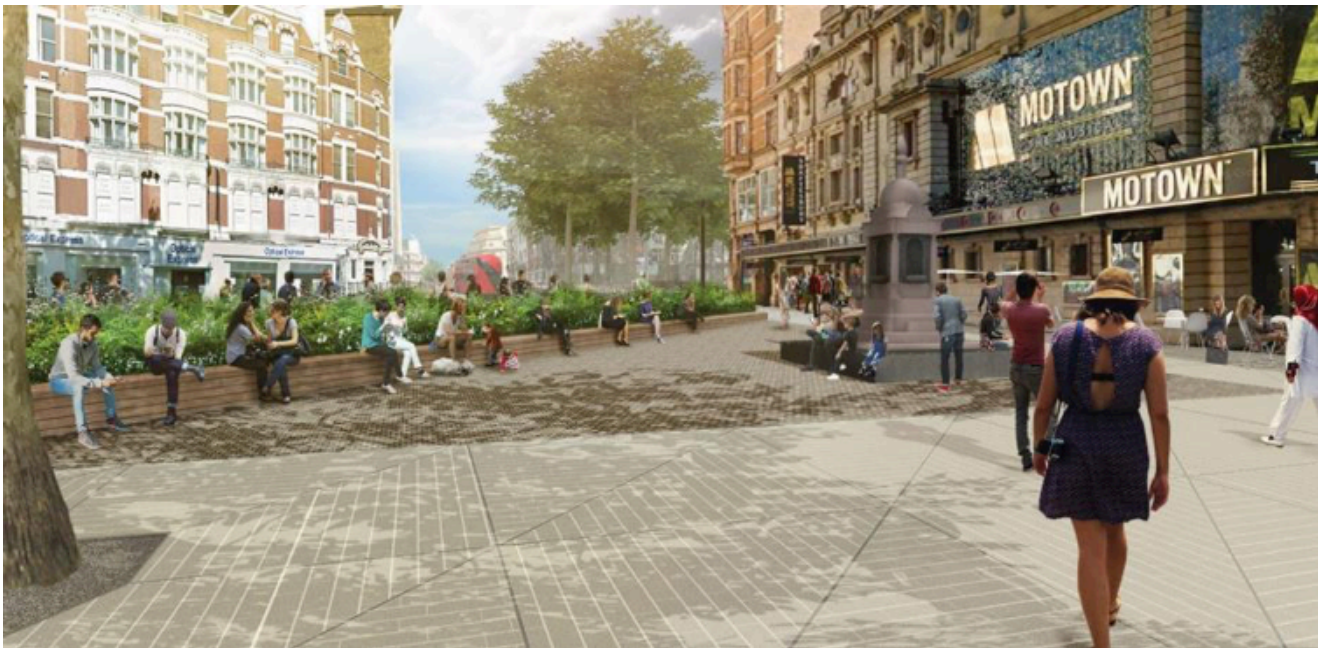
Figure W2: Creating places for people: Princes Circus, as part of the West End Project