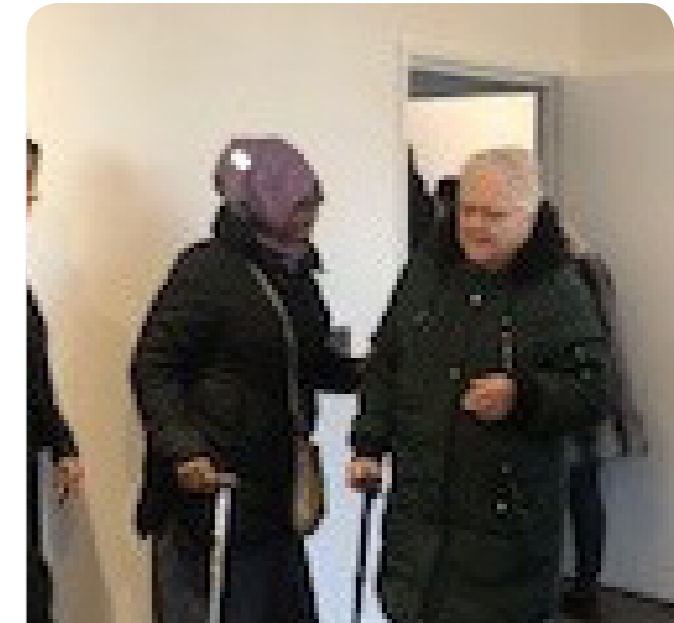
Neighbours viewing new homes together on recent site visit