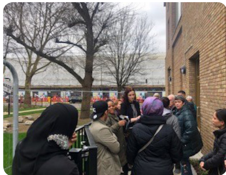
Recent estate Saturday site visit to Regents Park